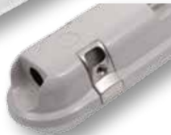
End and rear cable entry