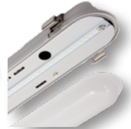
LED array and polycarbonate diffuser