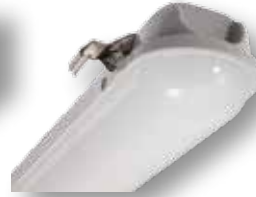
Retained diffuser clips