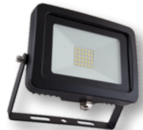
20w Non PIR