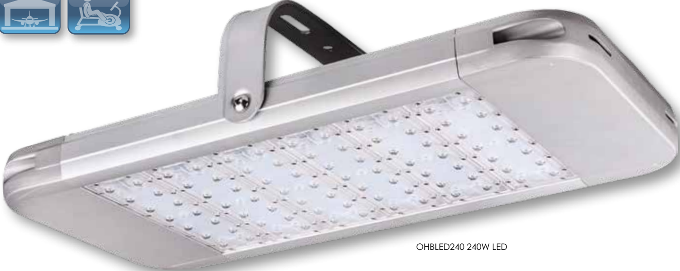
OHBLED240 240W LED