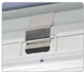
STAINLESS STEEL CLIPS