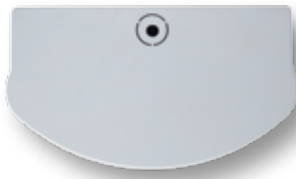
Architectural curved profile