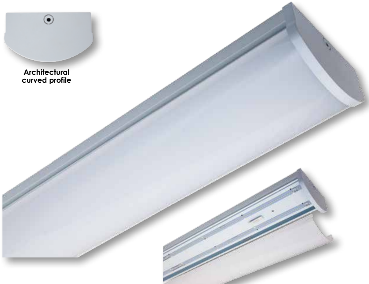
Standalone emergency LED array