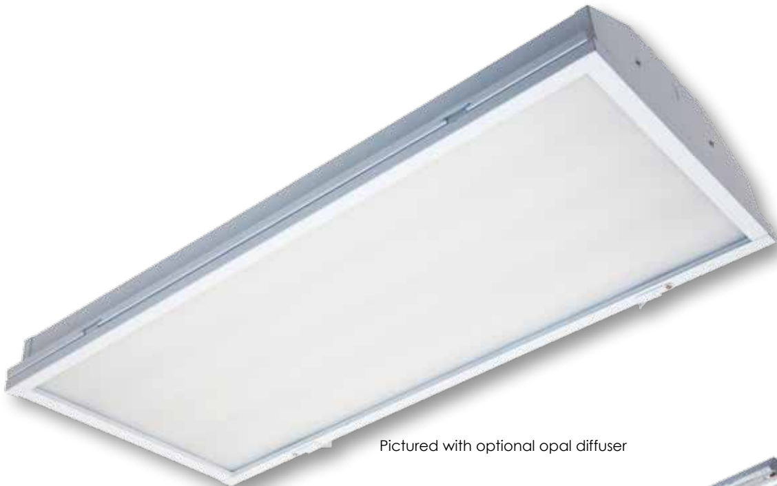
Pictured with optional opal diffuser