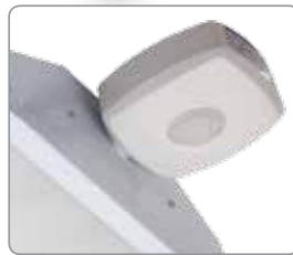
/HMS: On/Off sensor (up to 13m)