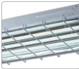
/WG: Wire guard