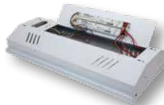
Rear access for easy installation