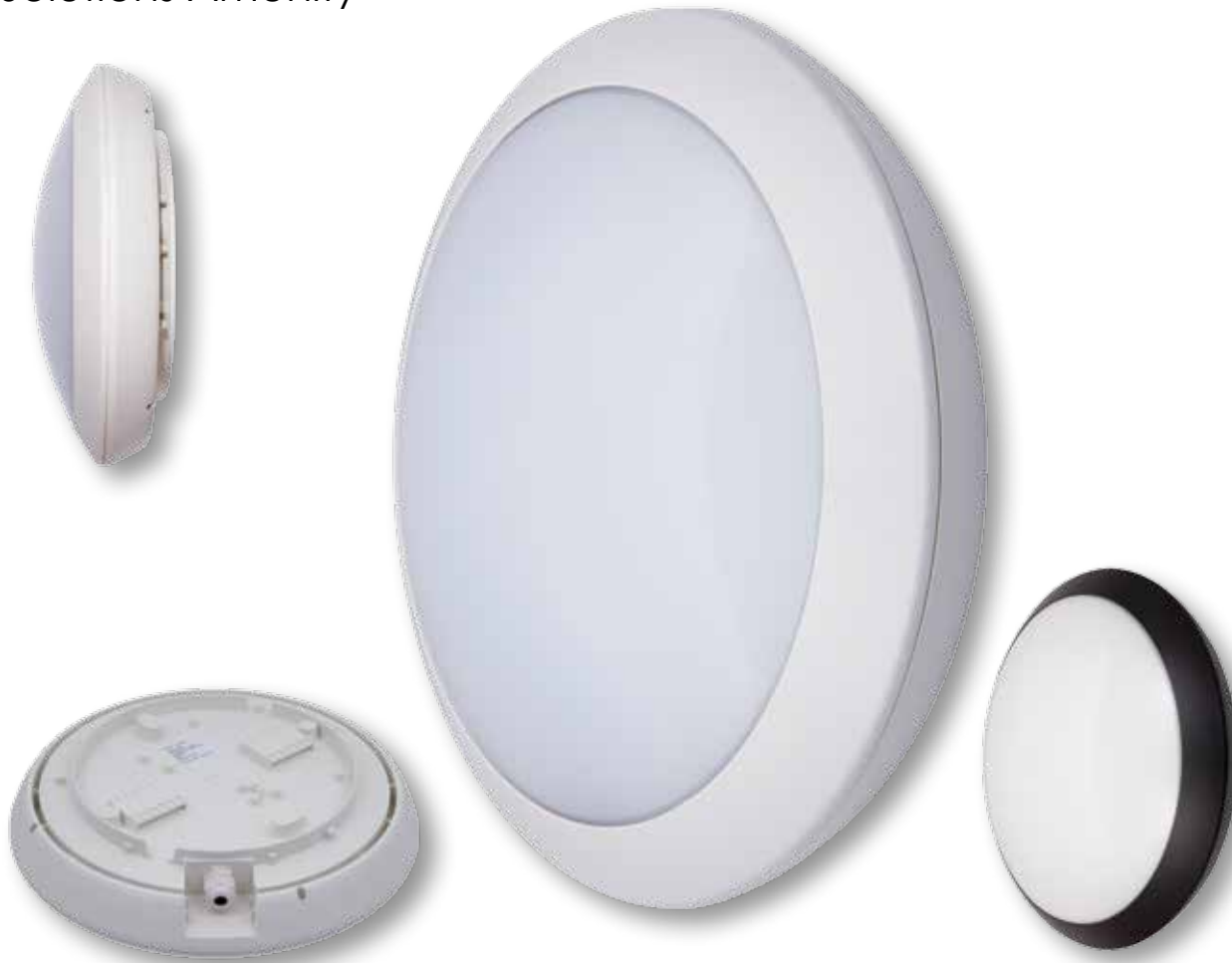
Side cable entry