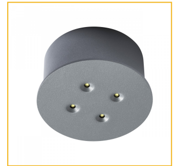
Surface Mounted, Silver