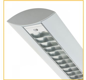
Command Plus COMPL4