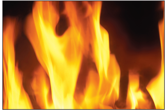
Upgrades the fire performance of previously painted surfaces

Call 0191 411 3148 for assistance from our helpdesk, or visit www.tor-coatings.com to find out more.