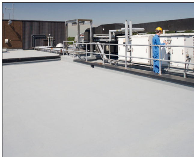
Above: Elastaseal™ used on the roof of a food processing factory

* this reinforcing mat is applied into the wet embedment coat