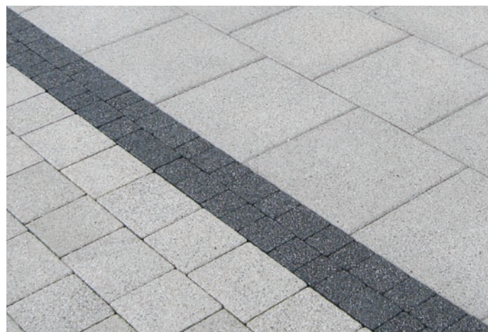
Eco Fusion 200 x 200 x 60mm Silver, 100 x 100 x 60mm Graphite and 400 x 400 x 60mm Silver