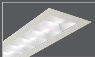
Faceted cross blade version