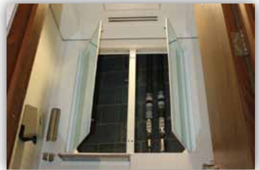
Example of surrounding construction