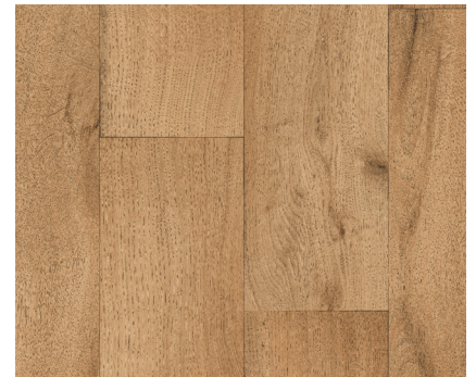
029 Arcadia Middle Natural