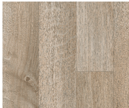
027 Antik Oak Light Natural