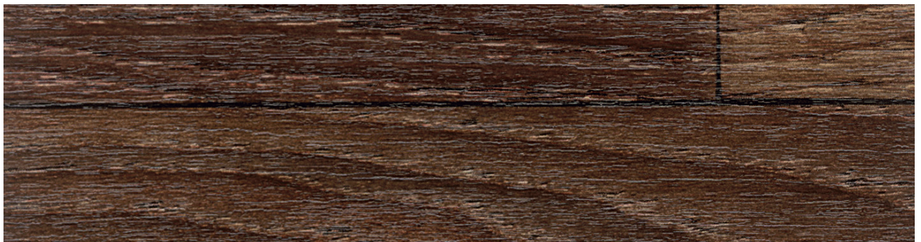
001 Soft Elm Brown