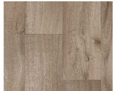
032 Arcadia Light Yellow