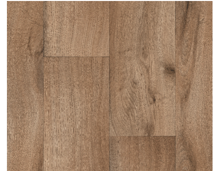
030 Arcadia Brown Natural