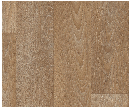
028 Soft Elm Natural