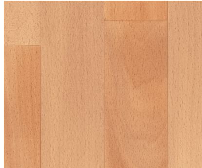
025 Beech Beige Brown