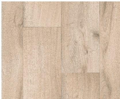
031 Arcadia Light Grege