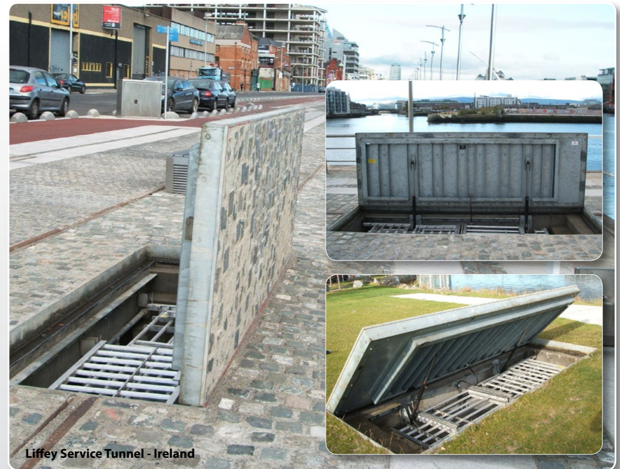
Liffey Service Tunnel - Ireland