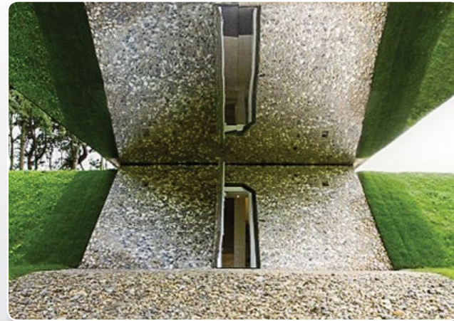
The Balancing Barn