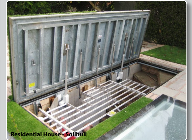
Residential House - Solihull