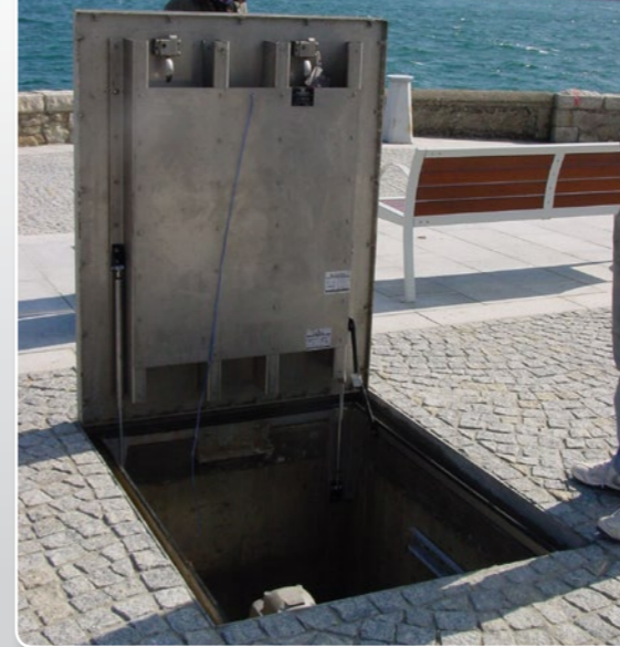
Liffey Service Tunnel - Dublin