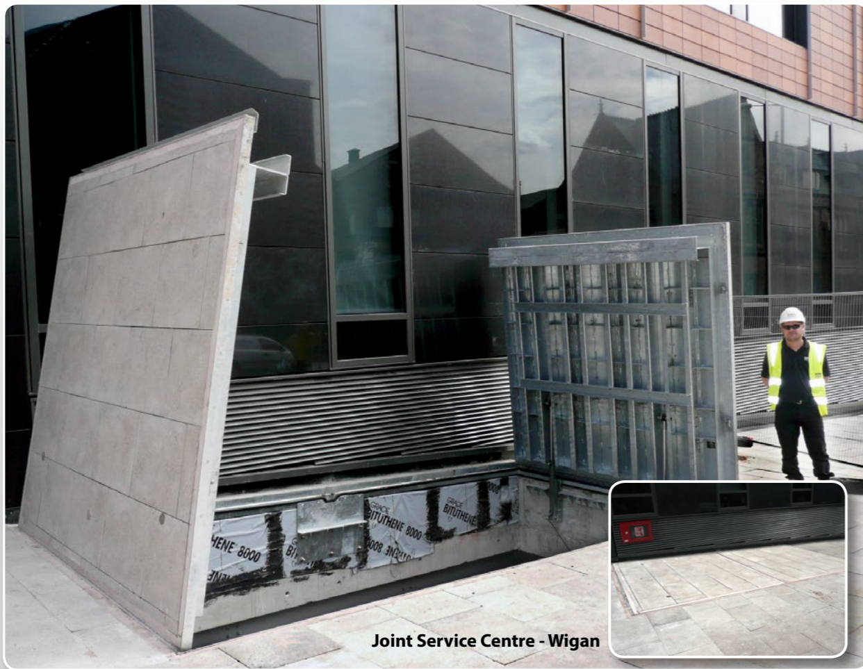
Joint Service Centre - Wigan