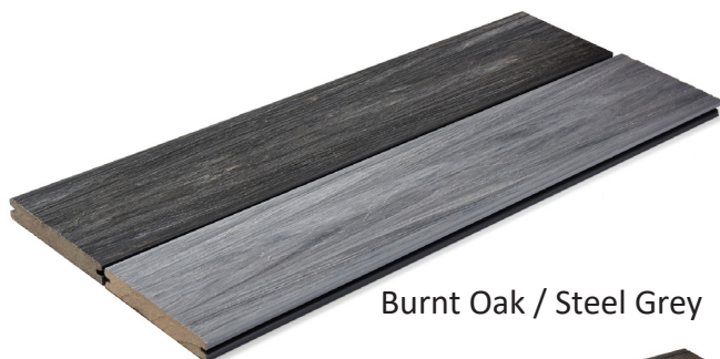
Burnt Oak / Steel Grey