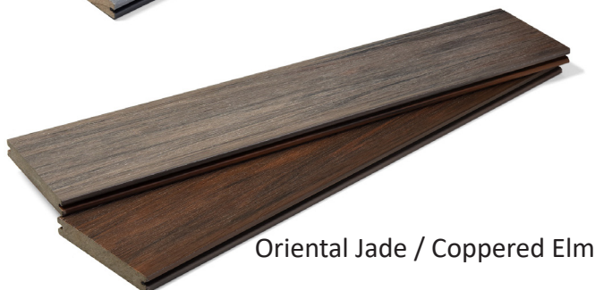
Oriental Jade / Coppered Elm