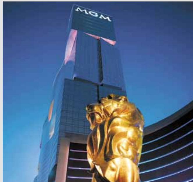
MGM Hotel-Casino, Macau, China