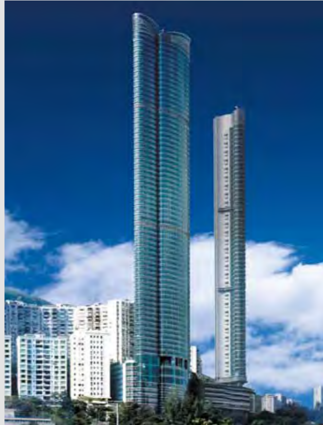
Highcliff / The Summit, Hong Kong, China