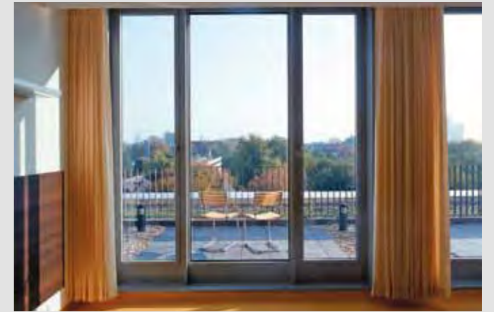
Cardiac Clinic, Cologne, Germany

Fabrics: Colorama 2, colour 410 white with special fabric surface treatment.