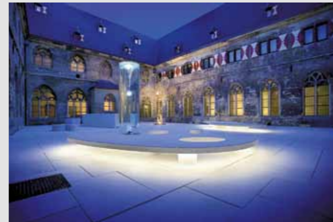
Kruisheren Hotel, Maastricht, The Netherlands

This erstwhile 15 th Century monastery enchants its guests with a unique blend of Gothic architecture and streamlined, modern interiors. The elegant combination of two roller blind systems provides practical screening and glare protection.