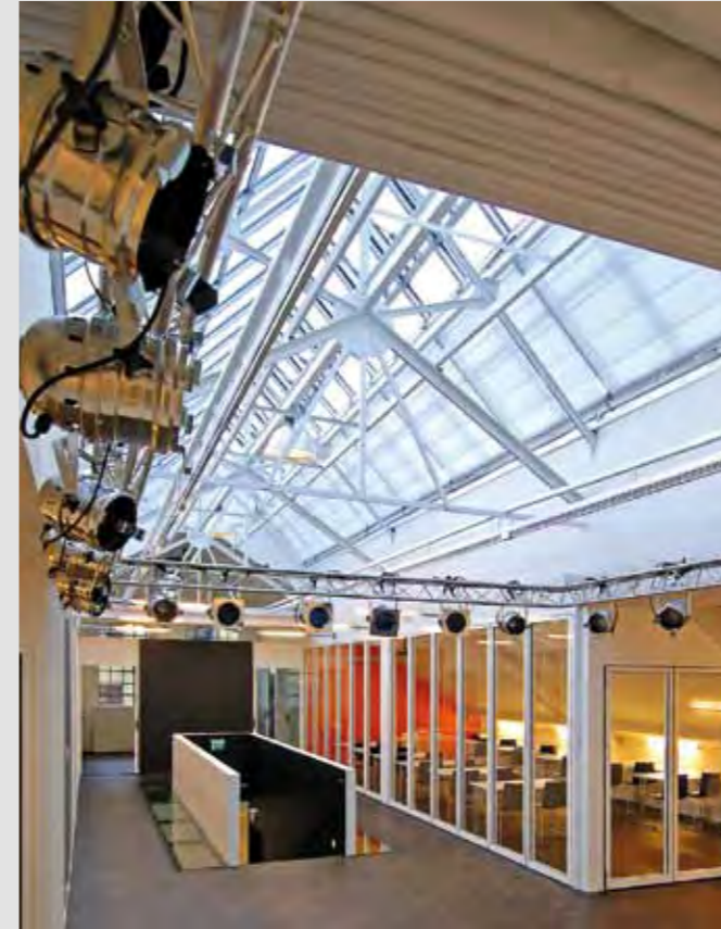
L'Oréal, Oslo, Norway

The interior designer had a tricky problem to solve with the relocation of the L'Oréal showroom: natural light in the new premises had to be adjusted to allow catwalk shows and product presentations during the day. The combination of two modern Silent Gliss skylight systems proved the ideal solution for darkening the former locomotive factory that dates back to 1860.