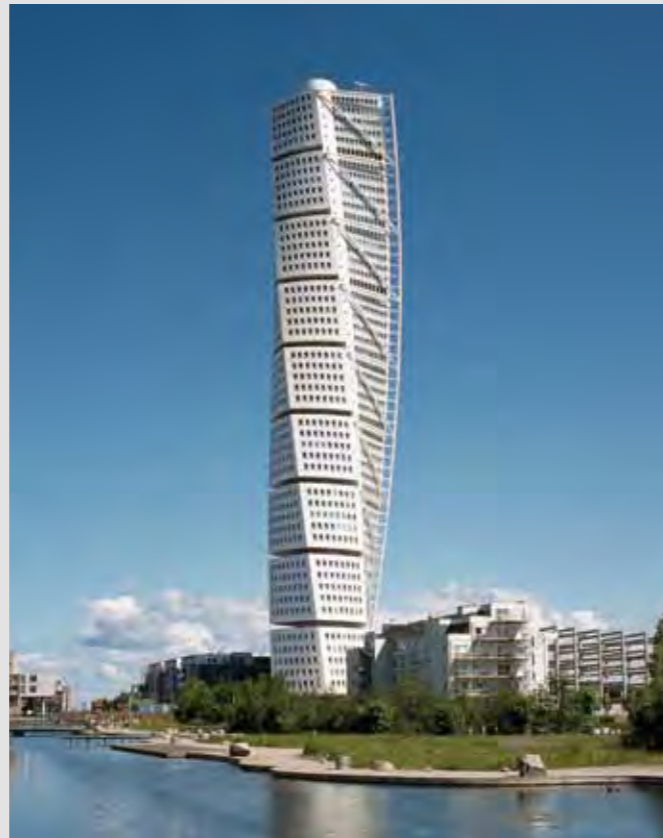
Turning Torso Tower, Malmö, Sweden