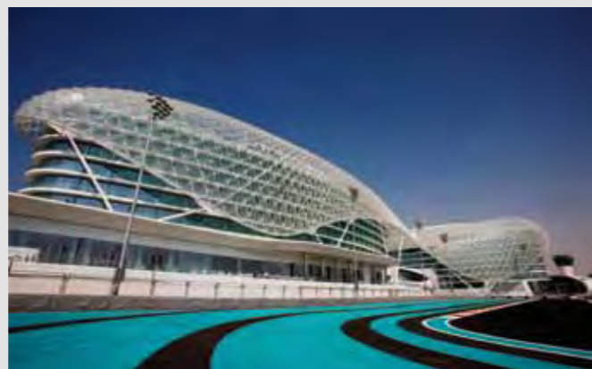
Yas Marina Hotel & Yas Marina Formula 1™ Circuit race track, Abu Dhabi, UAE