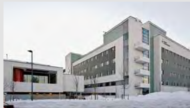
Akershus University Hospital, Akershus, Norway