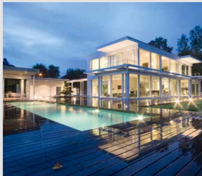
Casa Bianca, Bern, Switzerland