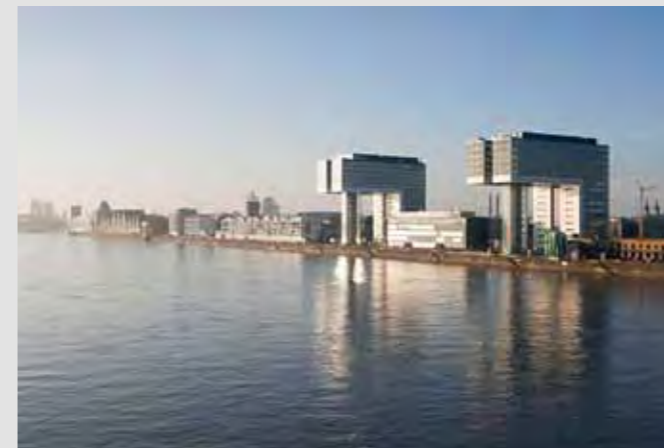
Kranhaus Mitte, Cologne, Germany

The new "Kranhauser" at the Rheinhafen is already a landmark in Cologne. The three buildings include high-end office space and residential apartments. Most are equipped with Silent Gliss systems, for example the new offices of law firm Rodl & Partner.