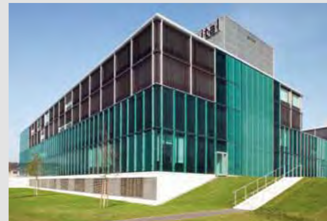
Zug Cantonal Hospital, Baar, Switzerland

Built by the architects Burckhardt & Partner, the new cantonal hospital of Zug is a modern competence centre for health. As modern as the building itself is the contemporary way of room dividing with roller blinds which was made possible due to the use of specially treated fabrics.