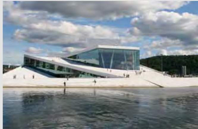
The Norwegian National Opera & Ballet, Oslo, Norway