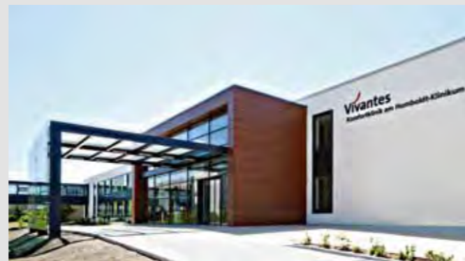
Vivantes Humboldt-Clinical Centre, Berlin, Germany