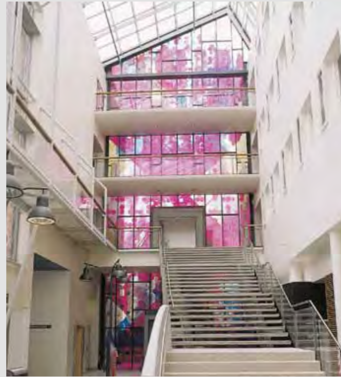
Rikshospitalet, Oslo, Norway

Kuwait Institute for Scientific Research, Kuwait City, Kuwait American Hospital, Dubai, UAE Hammad General Hospital, Doha, Qatar Kingdom Medical Centre, Riyadh, Saudi Arabia Military Hospital, Kuwait City, Kuwait Riffa Military Hospital, Bahrain Tai Po Hospital, Hong Kong, China Holsworthy / St. Georges / Westmead Hospitals, NSW Australia Central Hospital, Benghazi, Libya Rigshospitalet, Copenhagen, Denmark St Thomas' Hospital, London, UK Wythenshaw Hospital, Manchester, UK Whitchurch Hospital, Cardiff, UK Krankenhaus, Waldhof-Eigershausen, Germany Hopital de Baviere, Liège, Belgium Darenth Park Hospital, Dartford, UK Royal Free Hospital, London, UK Farnborough Hospital, Bromley, UK Krankenhaus St. Clara, Rotterdam, The Netherlands Inselspital, Bern, Switzerland Royal Hospital, Muscat, Oman Kuala Pilah Nucleus Hospital, Kuala Pilah, Malaysia John Radcliffe Hospital, Oxford, UK Charing Cross Hospital, London, UK El Salam International Hospital, Cairo, Egypt