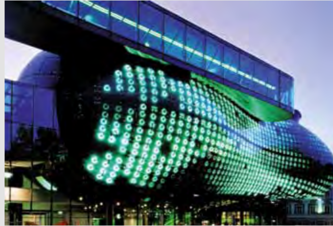
Kunstmuseum, Graz, Austria