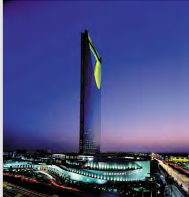
Kingdom Tower, Riyad, Saudia Arabia

Sage H.Q., Gateshead, UK SAB Miller, Woking, UK IFC Tower, Emirates Tower, Dubai, UAE Al Ahli United Bank, Bahrain ADCO H. Q., Abu Dhabi, UAE World Trade Centre, Shenzhen, China The Grand Mosque, Mecca, Saudi Arabia Saab-Scania, Helsinki, Finland Salle Gustave Eiffel, Eiffel Tower, Paris, France IMB-Verwaltung, Munich, Germany Fiat, Turin, Italy Christies, London, UK Dixons H.Q., Hemel Hempstead, UK Eden Project Conference Centre, Cornwall, UK City Hall, Amsterdam, The Netherlands Banque Internationale, Luxembourg Credit Communal, Brussels, Belgium IBM Headquarters, Oslo, Norway Volvo Head Office, Gothenburg, Sweden Bell Canada, Trinity Square, Toronto, Canada SAP, Walldorf, Germany BHF Bank, Geneva, Switzerland Red Bull, Oslo, Norway DLA Piper, Amsterdam, The Netherlands Commonwealth Bank, Sydney, Australia Gehrke econ, Hannover, Germany ING-House, Amsterdam, The Netherlands