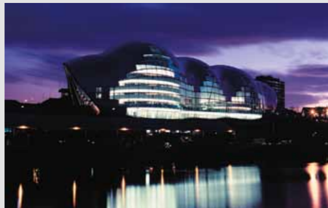
Sage Music Centre, Gateshead, UK