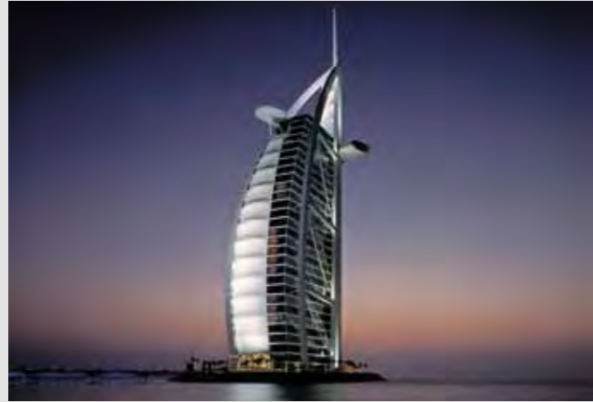
Burj al Arab, Jumeirah Beach, Dubai, UAE

Gleneagles Hotel, Perthshire, UK Puerta de America, Madrid, Spain Westin Hotels, Seoul / Shanghai Four Seasons, Riyadh / Hong Kong / UK / Amman Shangri La, Dubai / Muscat / Changchun Intercontinental Hotels, Doha / Beirut / Abu Dhabi / Muscat / Manila / Singapore Ritz Carlton, Doha, Qatar Accor Hotels, Europe Madina al Salam (Madinat), Dubai, UAE Marriott Hotels, Hamburg / Athens / Amsterdam / Cairo / Medina / Dubai / Amman The Waldorf Hotel, London, UK Amber Club, Zurich, Switzerland Lowry Hotel, Manchester, UK Hotel Medici, Rome, Italy Hotel de Keyser, Antwerp, Belgium Pulitzer Hotel, Amsterdam, The Netherlands Royal Viking Hotel, Stockholm, Sweden Parkhotel, Weggis, Switzerland Intercontinental Hotel, Cairo, Egypt Victoria Jungfrau, Interlaken, Switzerland Skydome Stadium/Hotel, Toronto, Canada Hyatt Xian A Fang, China Glass House Hotel, Edinburgh, UK Holiday Inn, Hilton and Raddison Hotels, UK Caesar's Palace, Las Vegas, USA MGM Grand Hotel, Las Vegas, USA New Furano Prince Hotel, Hokkaido, Japan Grand Hyatt Hotel, Taipeh, Taiwan Marriott Hotel, Gold Coast, Australia Chateau Gütsch, Luzern, Switzerland Tumba Gymnasium, Tumba, Sweden Hotel Ivoire, Abidjan, Ivory Coast MingJie Renaissance Hotel, Shanghai, China Kempinski Hotel, Munich, Germany Cardington House Hotel, Channel Islands Mandarin Oriental Hotel, Spain