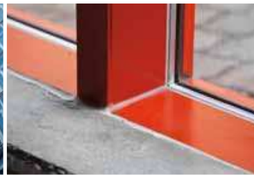
Sealing of connection joints around windows and doors