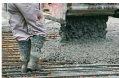
Quality concrete production solutions