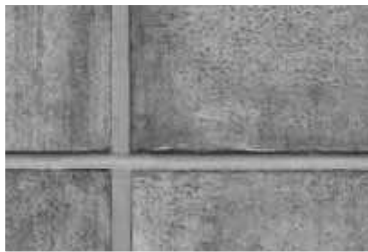
Sealing of stone, brick and concrete joints