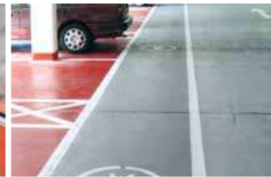
Sealing of floor joints in carparks and elsewhere