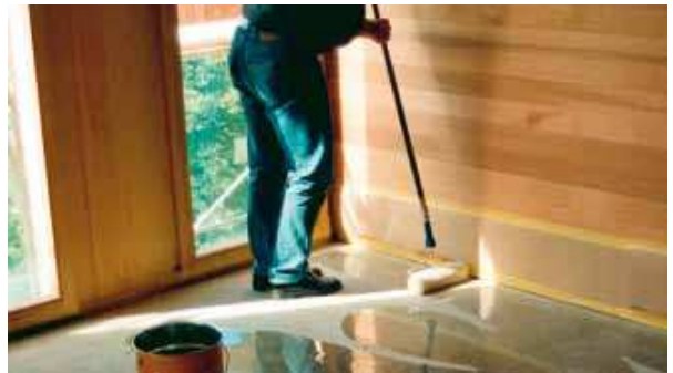
Fast setting products for fast renovations and sooner opening.