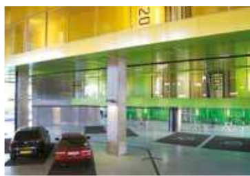
Flooring and coating solutions