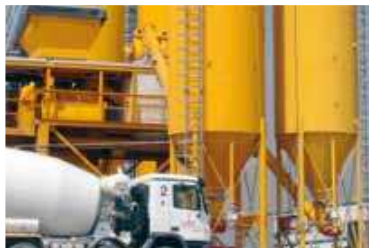
Ready-mix concrete production