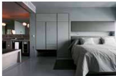
Aesthetical solutions with Sika Comfort Floors