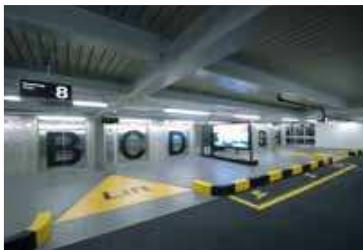
Flooring in car park decks