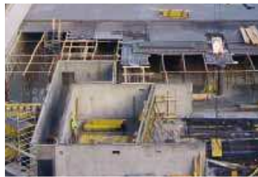
Watertight concrete for basement waterproofing