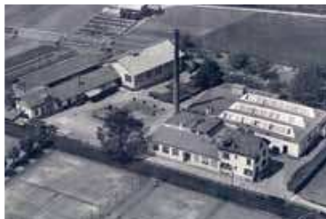
Sika was founded in Zurich in 1910