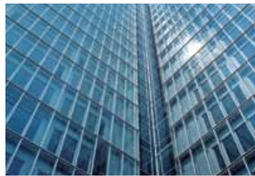
Sealing of glass façades