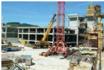
Site batched concrete production