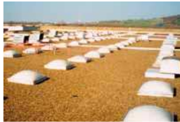
Roofing for gravel ballasted roofs