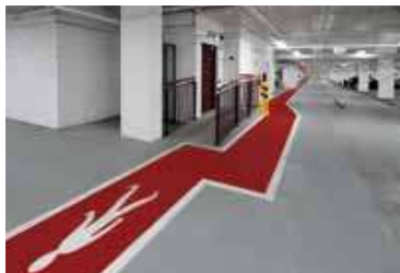
Flooring in car parking areas