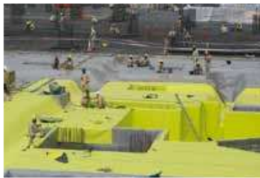
Membranes for basement waterproofing