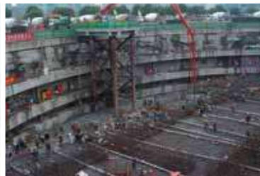
Special concrete applications