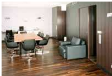
Wood floor bonding for all types of rooms and uses