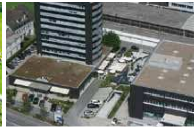
Roofing for exposed roofs