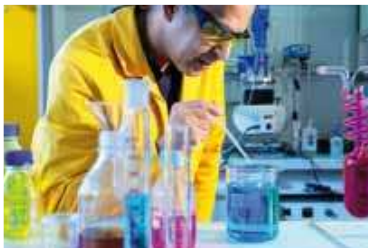
Innovative material technologies