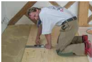
Noise reduction with Sika AcouBond