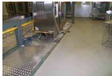
Floors for food processing areas