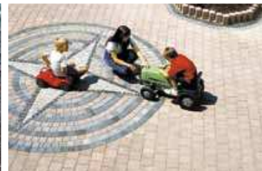
Semi-dry concrete production