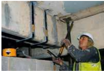
Shear strengthening of beams