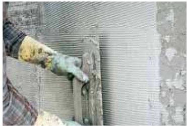
Hand applied mortar