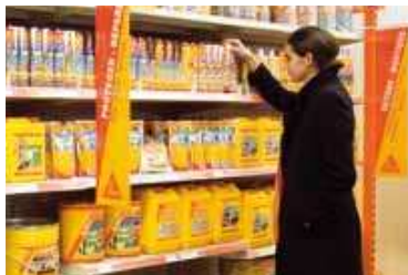
Efficient logistics and local availability