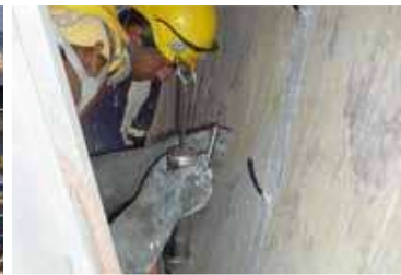
Watertight crack sealing by injection