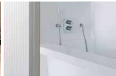
Decorative and protective coatings