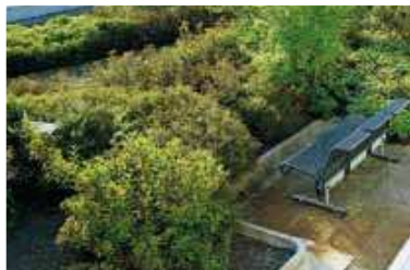
Focus on sustainability