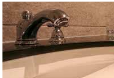
Sealants for waterproofing