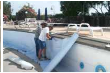
Waterproofing with flexible Sikaplan