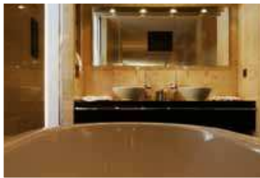
Waterproofing of wet rooms