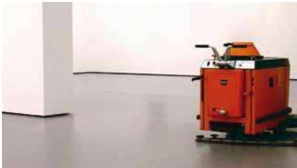
Sika provides Systems that require lower maintenance

Maintenance, renovation and life cycle management are very important factors when running a hotel. They can become expensive items on your income statement when not given sufficient attention and proper care. High maintenance costs can occur through wrong selection of systems which do not have the required performance to withstand the often severe exposure that occur in hotels - as for instance kitchen floors, entrance halls etc. The systems installed are much decisive of how the maintenance and the life cycle management have to be performed. The key to success lays already in the planning phase with competent consultancy goes on through the proper application of the products, and latter with the correct maintenance of the installed systems. Sika can support you through all different stages..