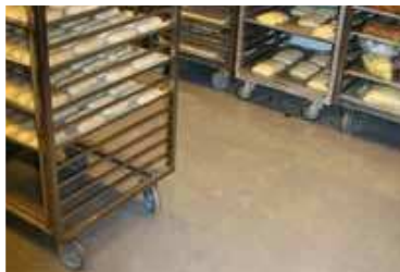
Floors for food storage areas