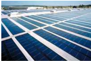
Roofing for solar roofs