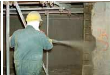
Machine applied concrete repairs