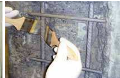
Protection of steel reinforcement