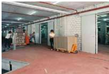
Flooring for logistics and storage areas