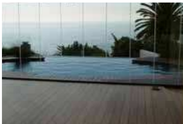
Beautiful and exclusive solutions with SikaBond