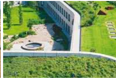
Roofing for green roofs