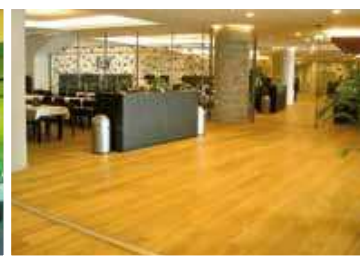
Wood floor bonding and interior finishing