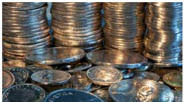
Sooner opening = earlier cash flow