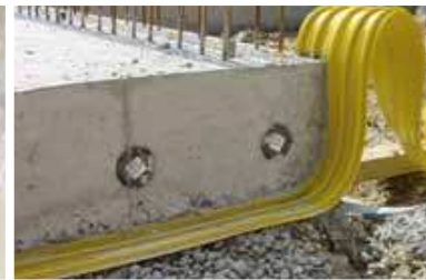
Waterstops for integral joint waterproofing