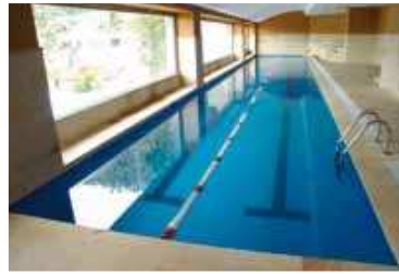
Tile adhesives for swimmingpools