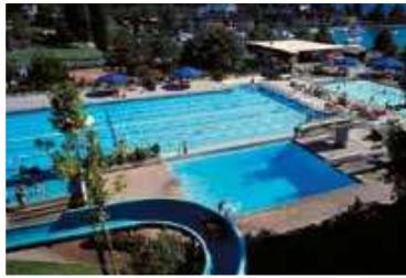
Sikaplan sheet membranes for waterproofing