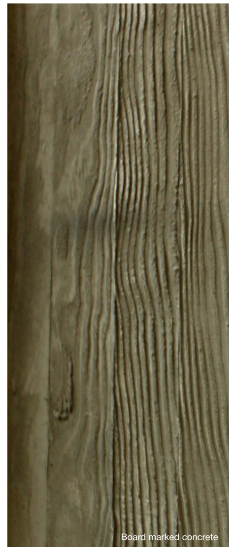
Board marked concrete

Flowable concrete allows for high-workability and easy placement whilst resisting segregation.