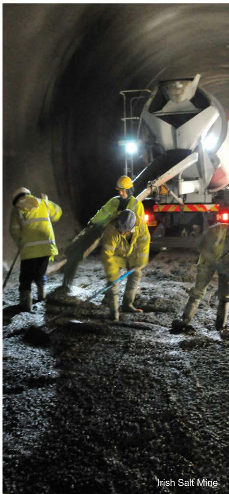
Irish Salt Mine

Fibre reinforced concrete incorporates fibre technology which is dispersed throughout the concrete ensuring three dimensional reinforcing. A selection of fibres are available depending on your specific requirements.