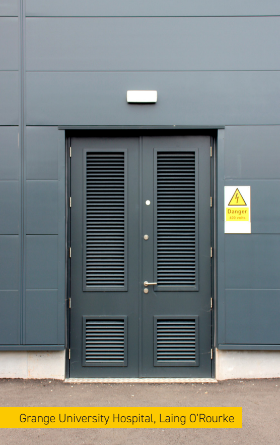
Grange University Hospital, Laing O'Rourke