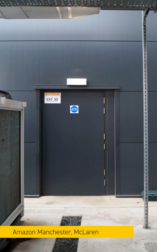
Amazon Manchester, McLaren