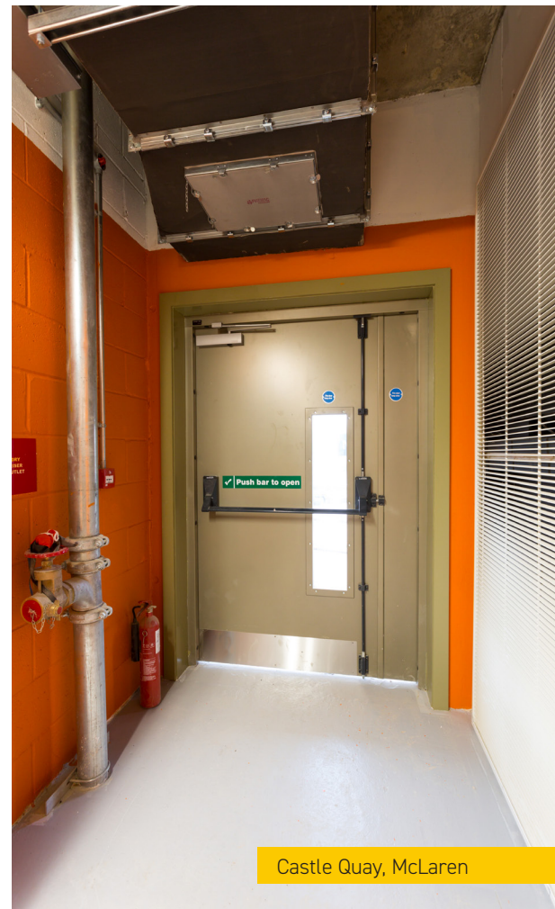
Castle Quay, McLaren