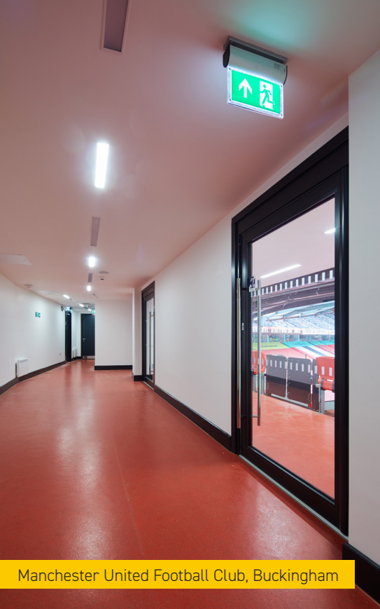
Manchester United Football Club, Buckingham