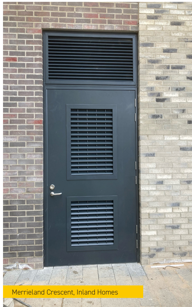
Merrieland Crescent, Inland Homes