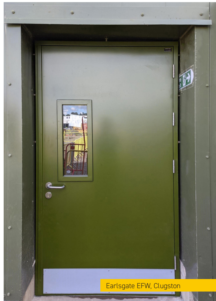
Earlsgate EFW, Clugston