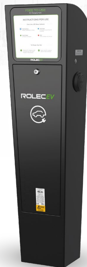
Unit shown: AUTOCHARGE:EV SUPERFAST 2way Socket (Type 2) Charging Pedestal

The AUTOCHARGE:EV SUPERFAST is a heavy duty, hard wearing EV charging pedestal, specifically designed and manufactured for both commercial and public facing environments.