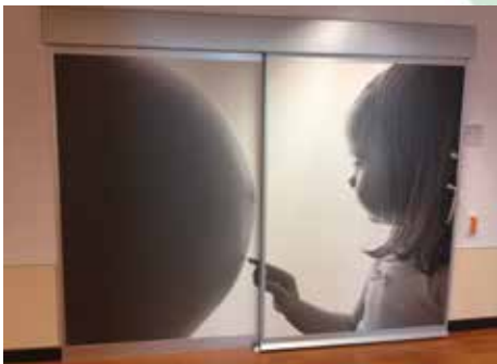
Hermetically airtight automatic door record CLEAN K1-A

The record program provides a wide range of automatic doors and peripherals for every conceivable application. Core products are linear and radial automatic sliding doors, swing door drives, folding doors, revolving doors, burglar-resistant doors, security doors for use in escape and rescue routes as well as for fire protection. There are also special products such as doors for hygienically demanding applications, airtight doors, high-speed doors and one-way access systems.