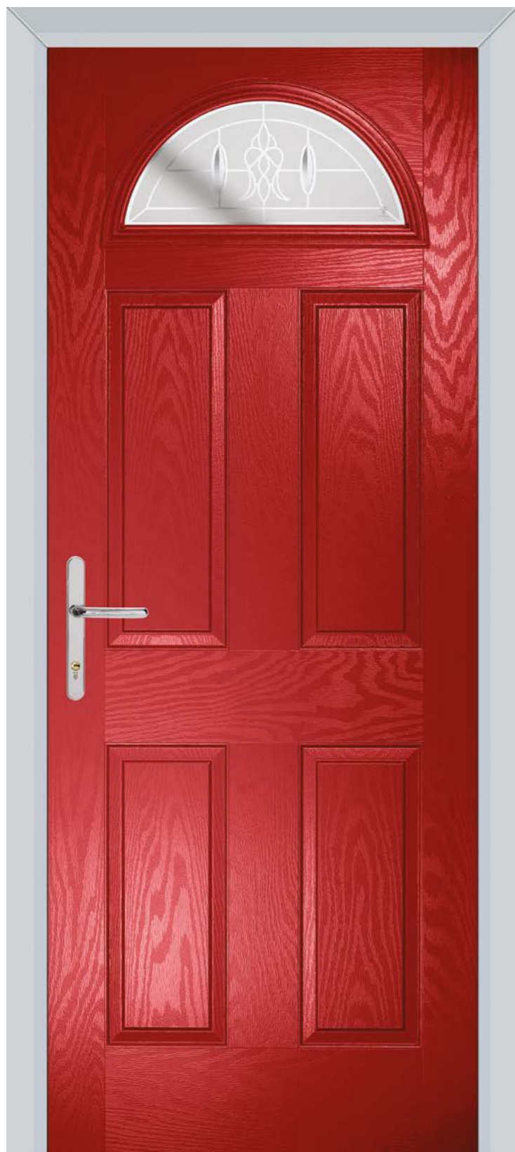
Red - AT1 - Pacific Glass