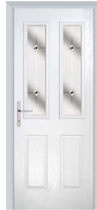
Etch Art Fusion