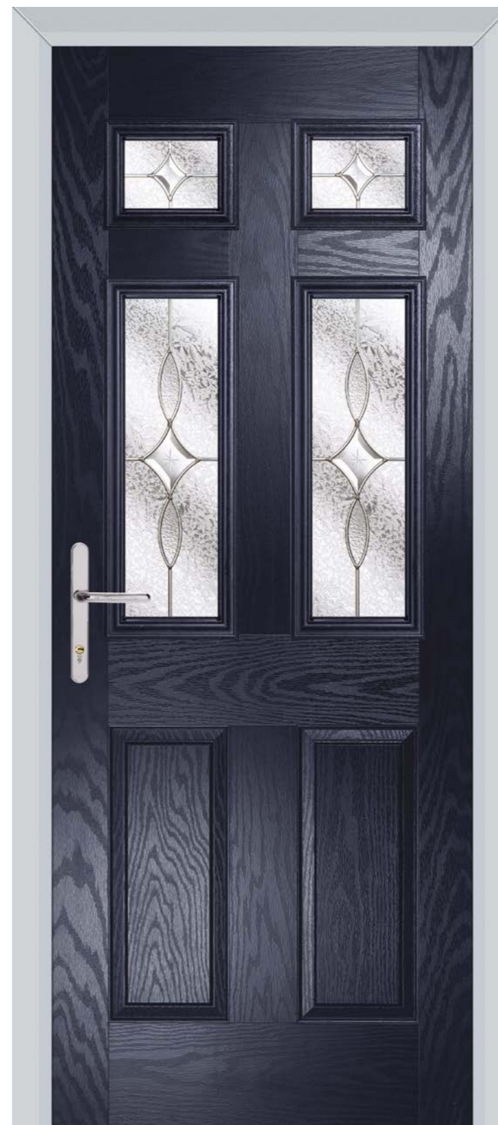
Blue - TG4 - Zinc Art Flair Glass