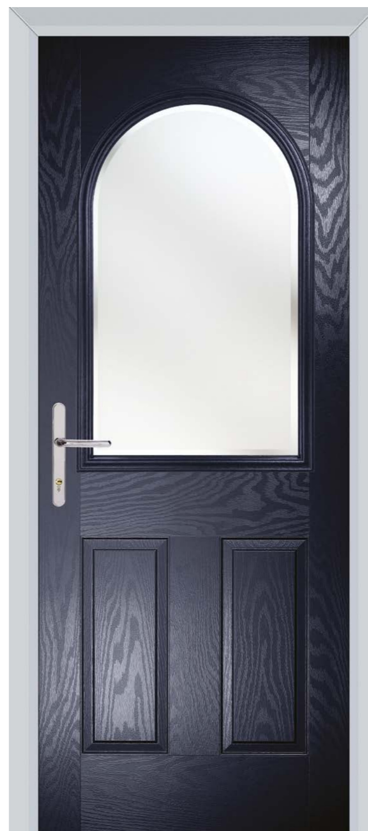
Blue - LGA1 - London Etch Border Glass