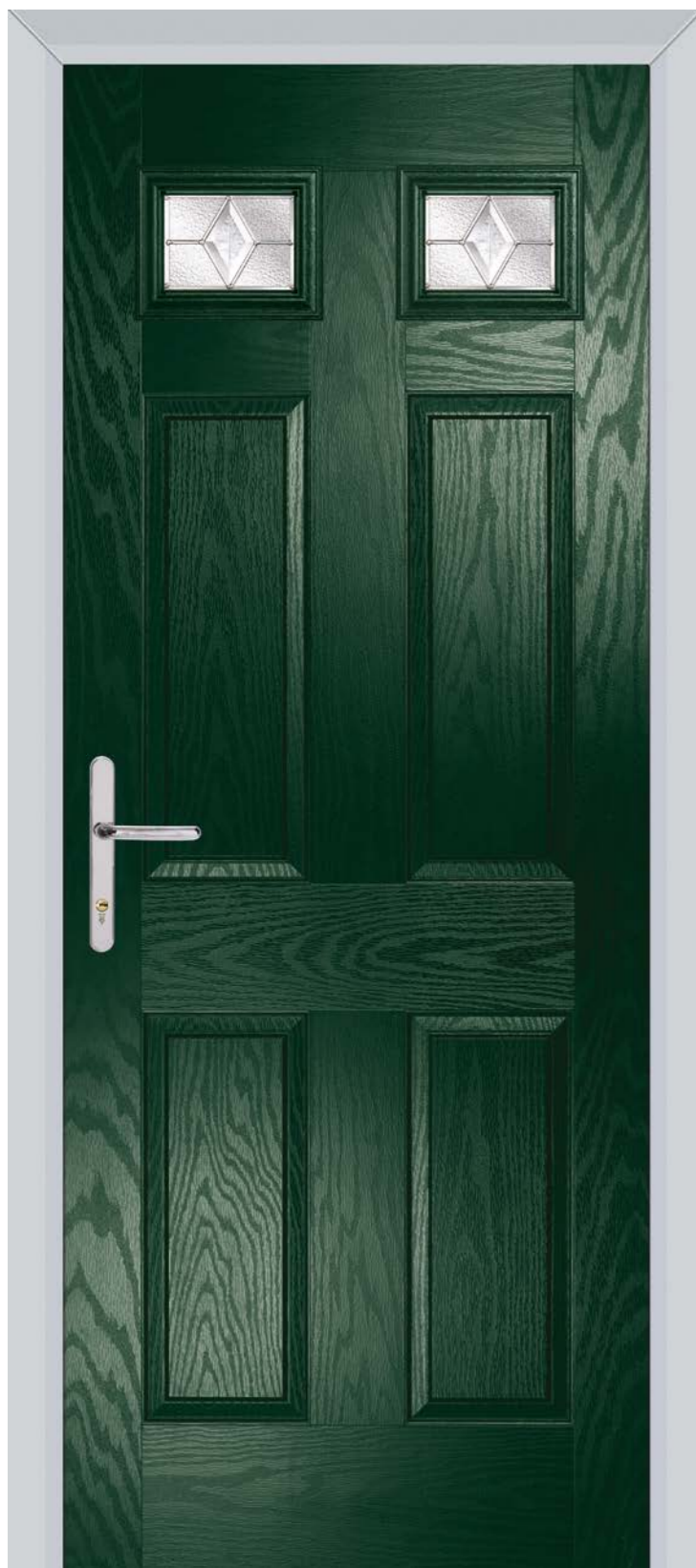
Green - TG2 - Classic Glass