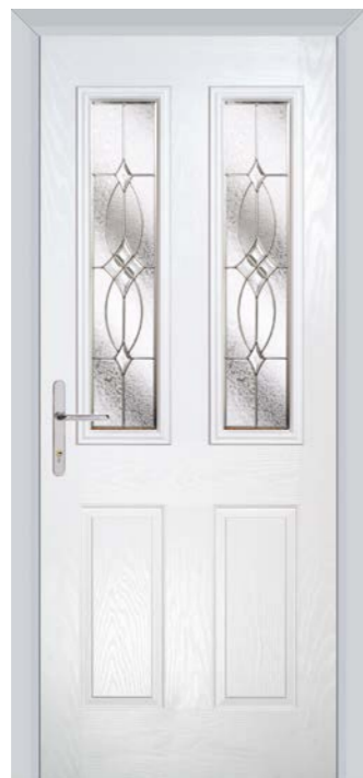
Zinc Art Flair