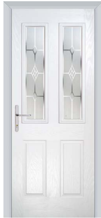
Etch Art Diamond