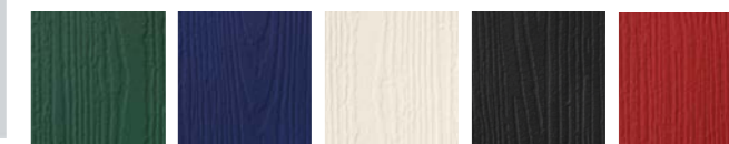
Green Blue White Black Red

These images are intended for illustration purposes only and may be subject to change for reasons beyond our control. As a consequence these images should be used for guidance only.