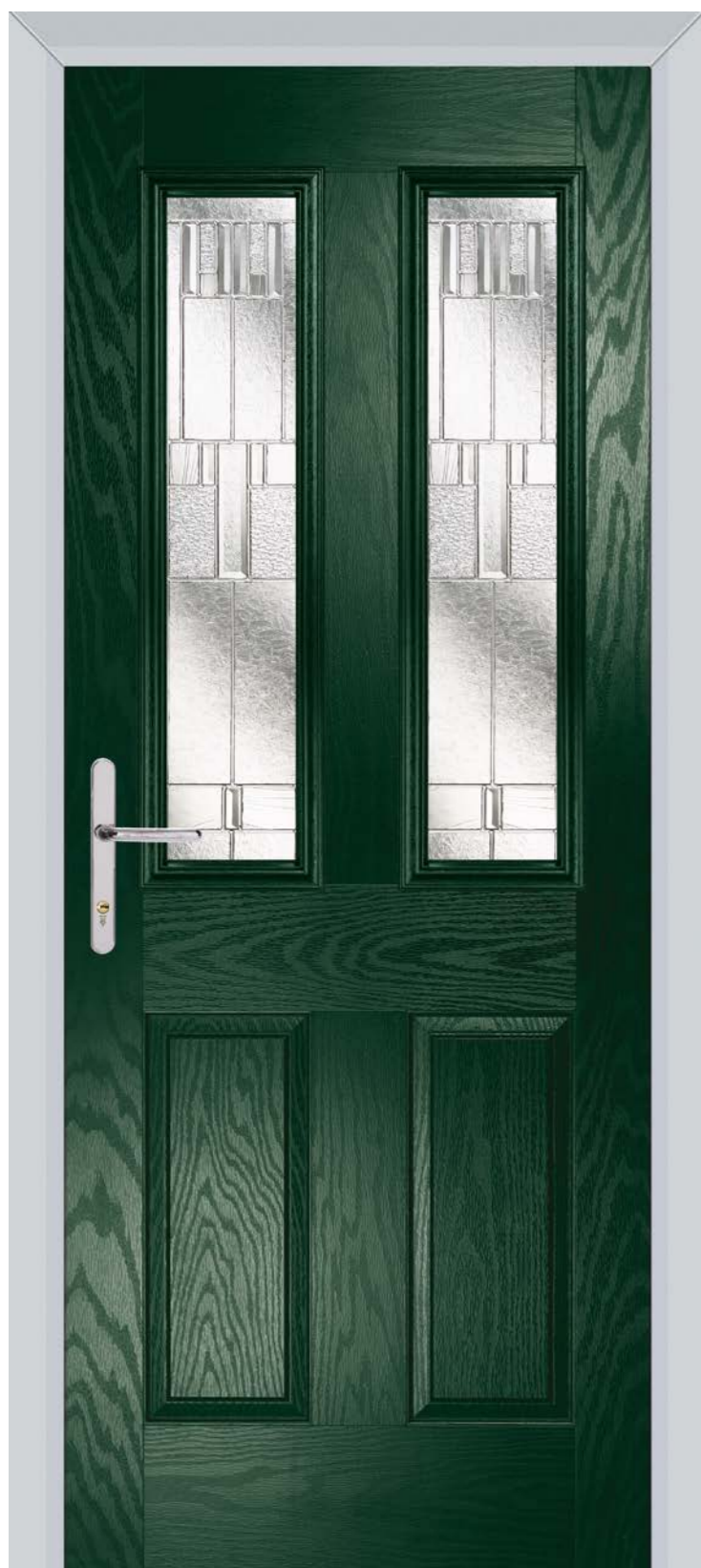
Green - LG2 - Chicago Glass