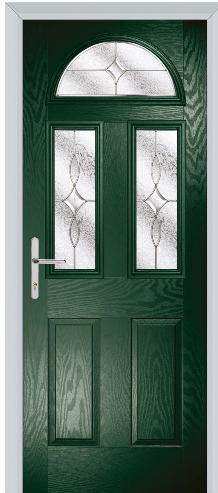
Green - AT3 - Flair Glass