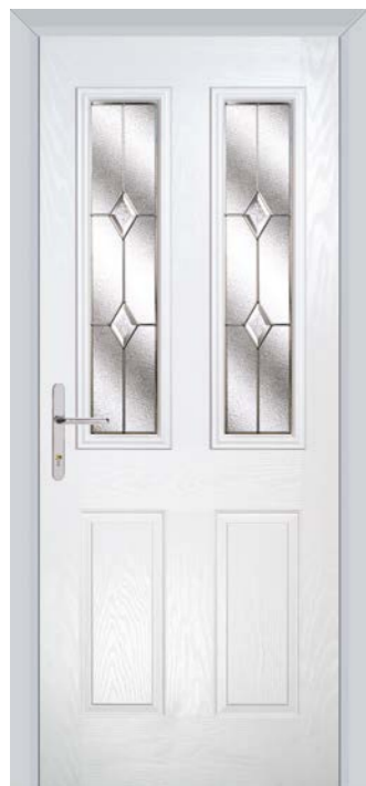
Zinc Art Classic