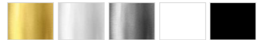
Gold, Chrome and Brushed Chrome are stainless steel as standard