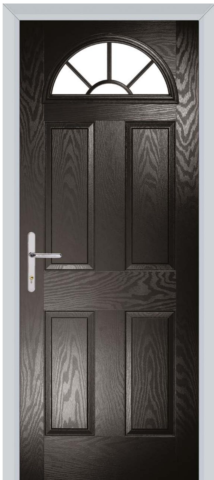
Black - ATF1 - Standard Clear Glass