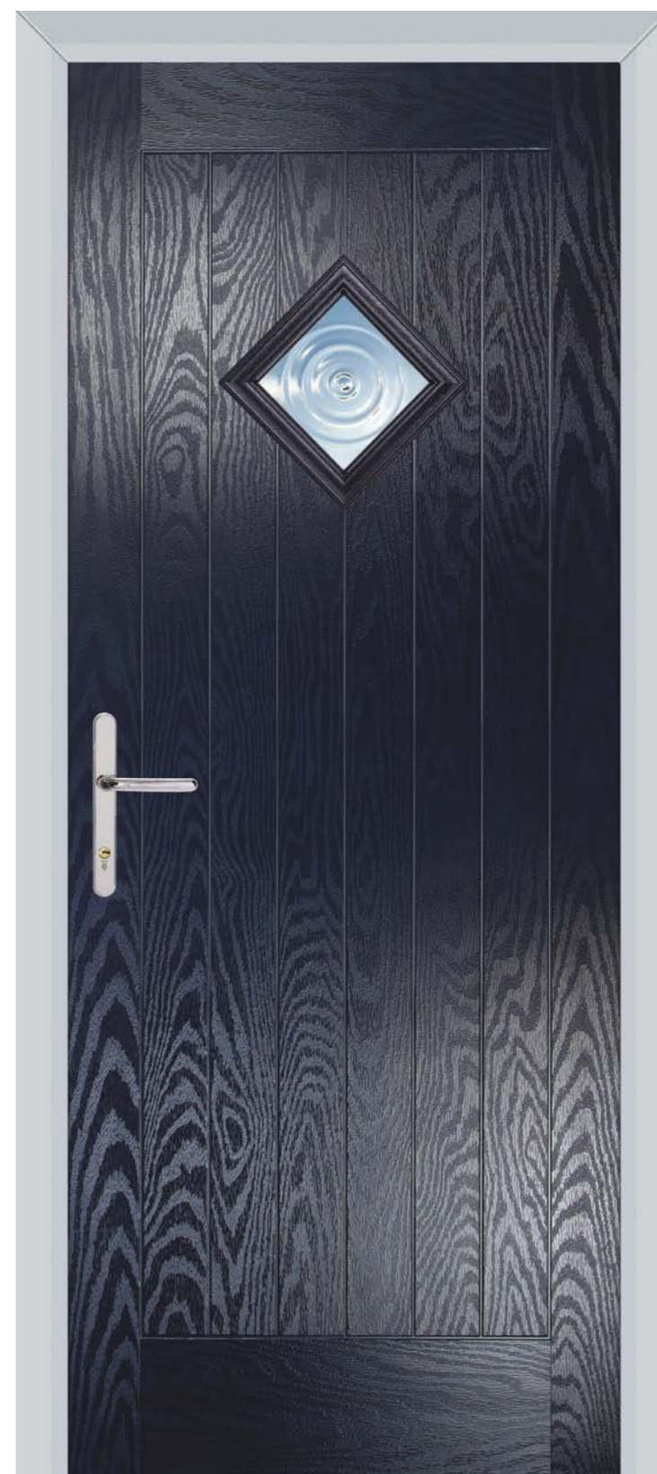
Blue - CG1 - Bullseye Glass