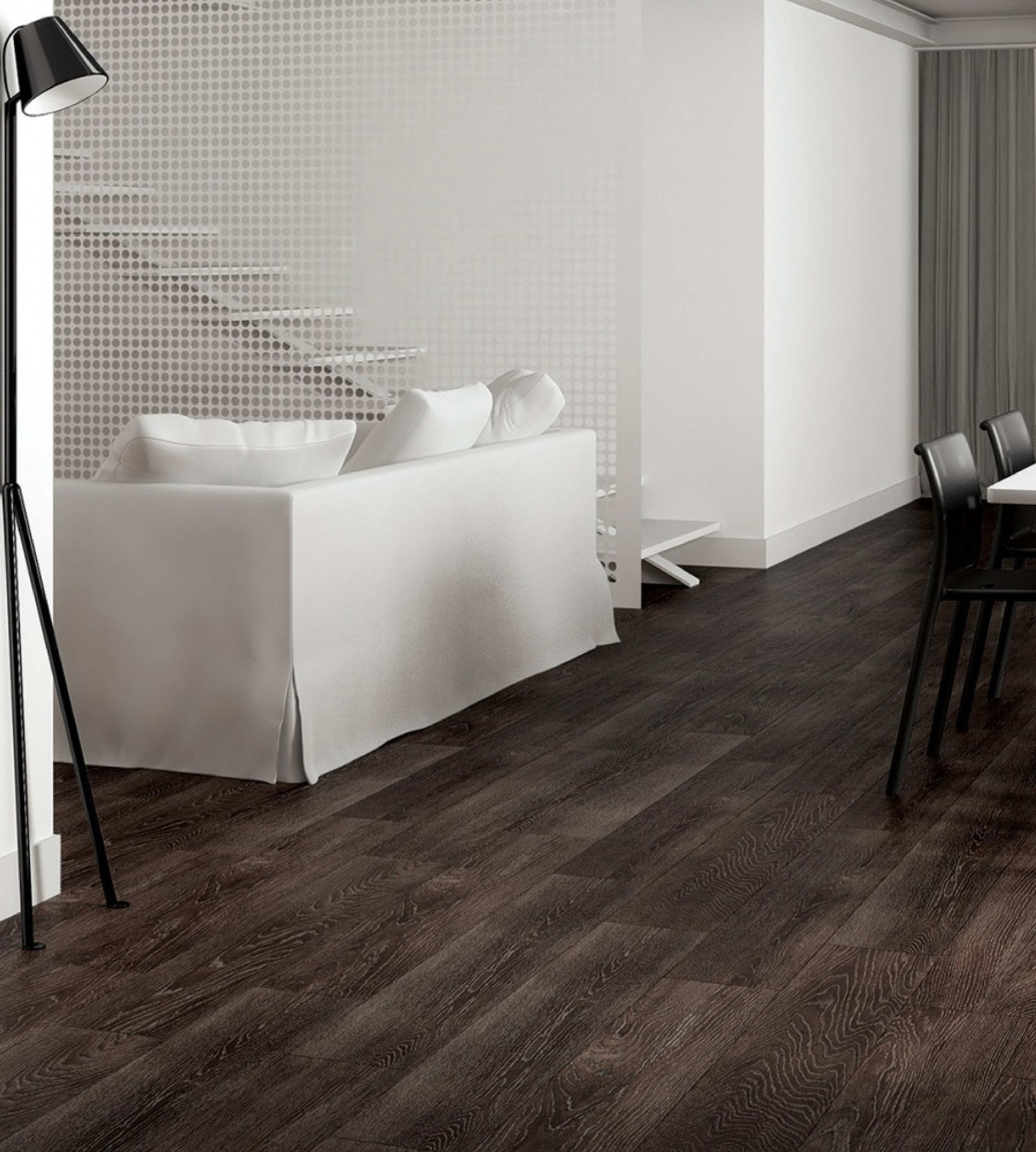
Legno Dark Brown