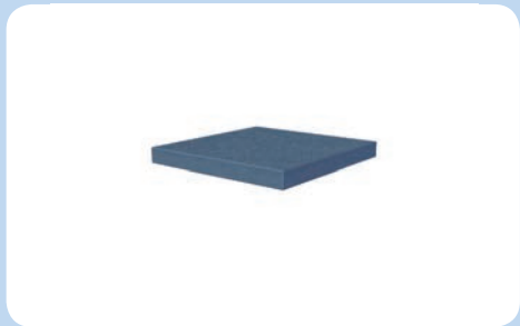
Wetpour Overlay Tarmac - For low level equipment