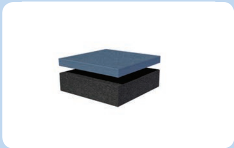
Wetpour Overlay Tarmac - For high level equipment