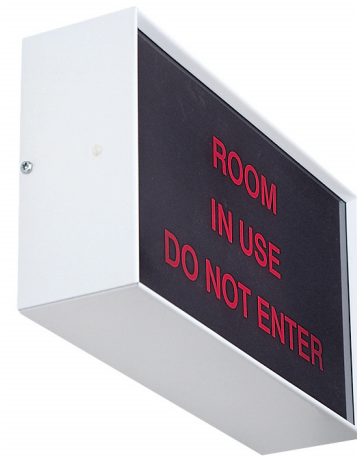
Table 'B': Finish Options

2850SL-B Where 'B' designates the finish. See Table 'B' for options & codes.