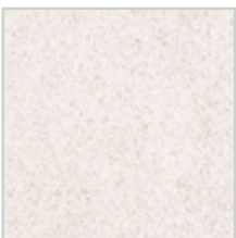
White (NCS ca. S 0500-N)