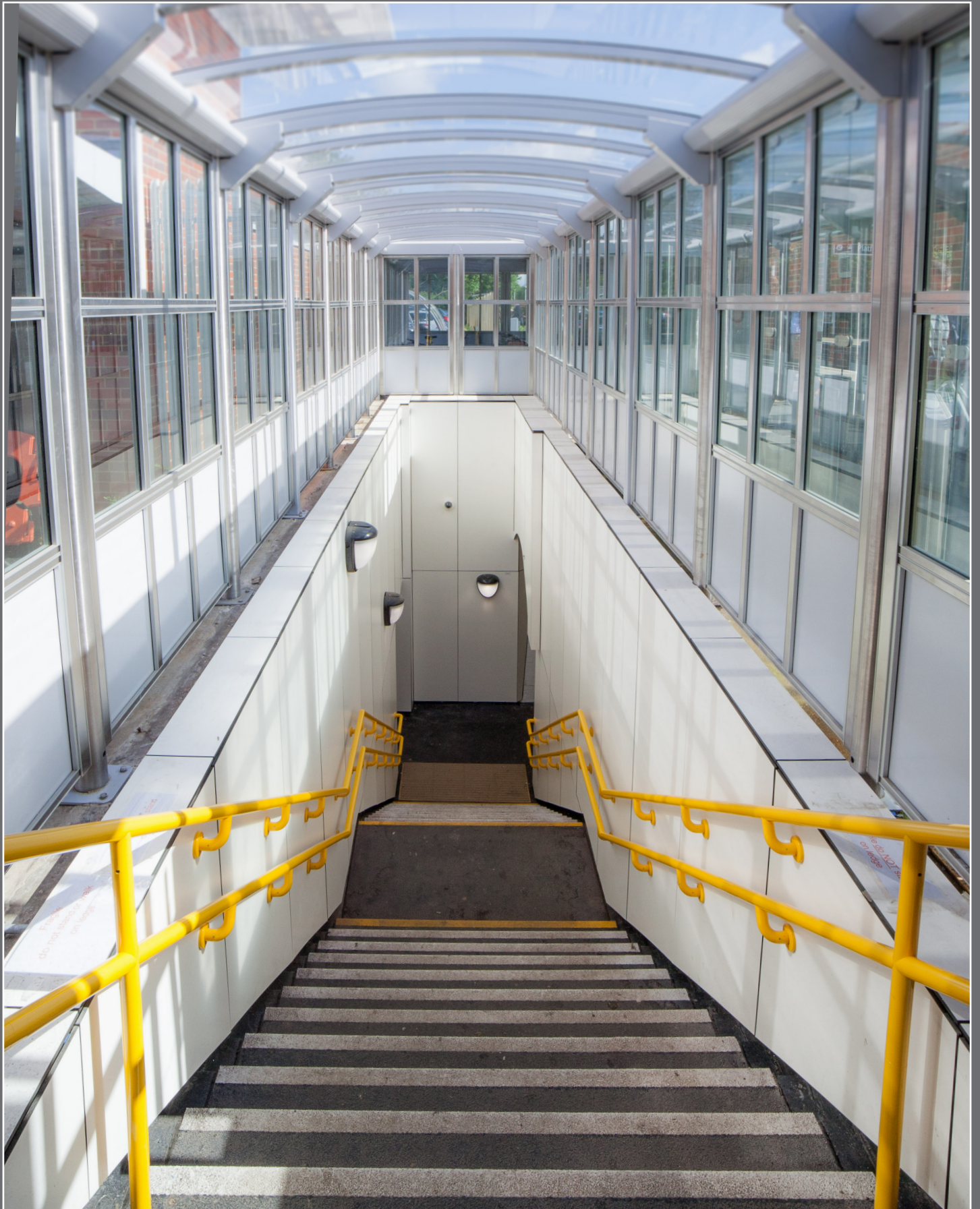
Panelock - TrafficWall Phenolic panels installed in a Train Station Subway