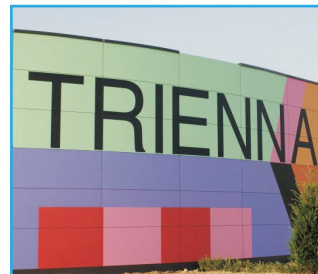
Abet - MEG Laminate An external grade decorative high-pressure laminate.