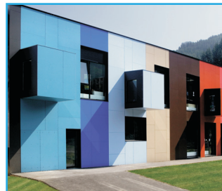
Formica Vivix An external grade decorative high-pressure laminate.