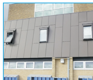
Rockpanel External cladding board manufactured from sustainable rock fibre.