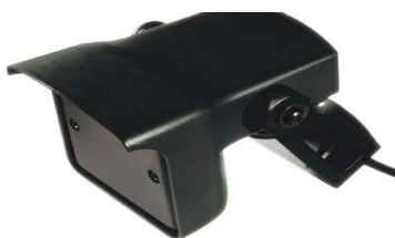
Figure 2: Falcon: from 3000 to 6000 mm