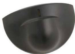
Figure 1. Eagle One: until a height of 4000 mm