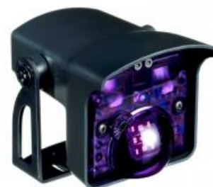
Figure 3. Condor: from 3500 to 6000 mm