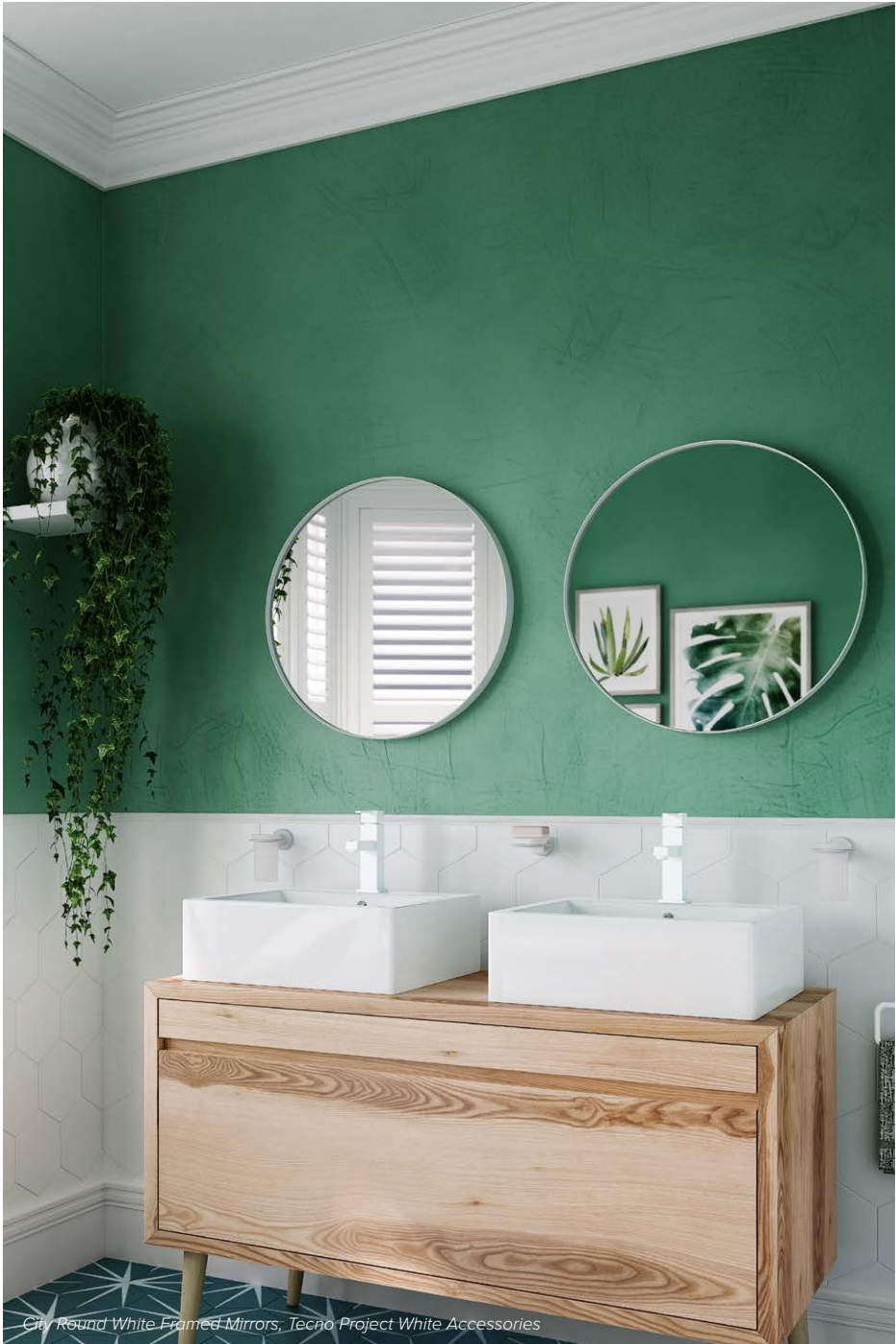
City Round White Framed Mirrors, Tecno Project White Accessories