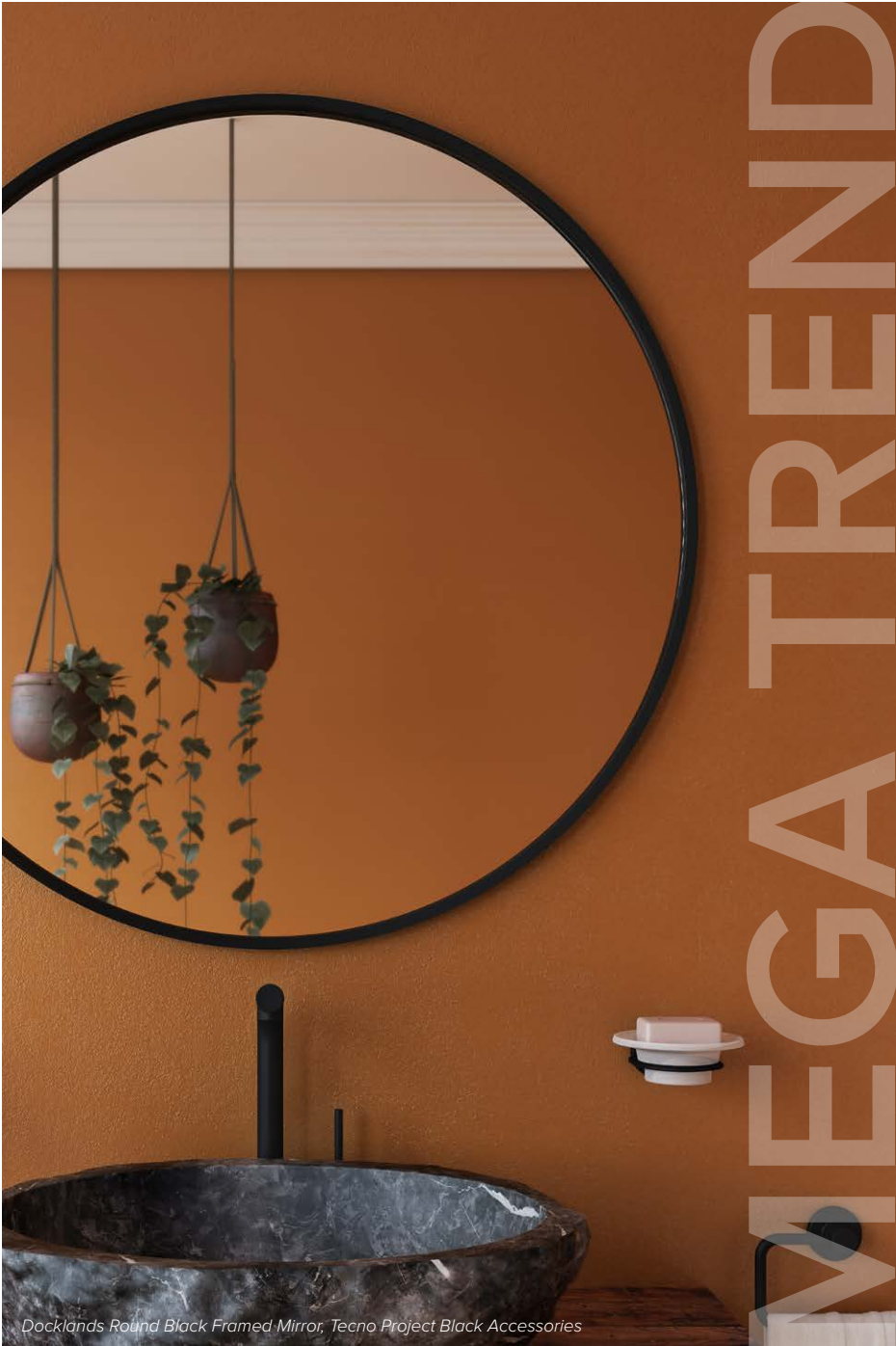
Docklands Round Black Framed Mirror, Tecno Project Black Accessories