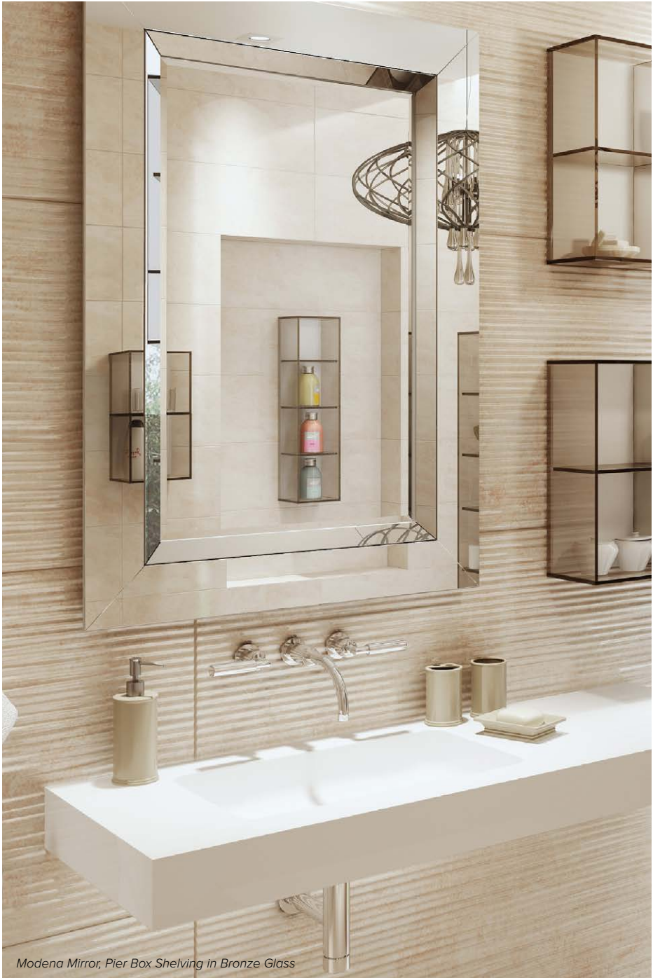
Modena Mirror, Pier Box Shelving in Bronze Glass