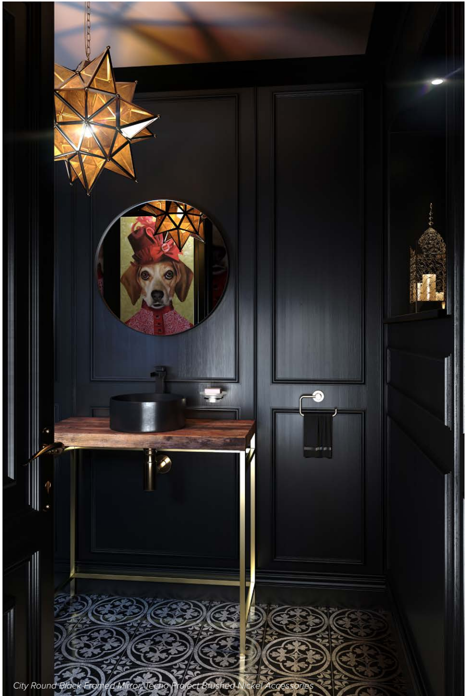
City Round Black Framed Mirror, Techno Project Brushed Nickel Accessories