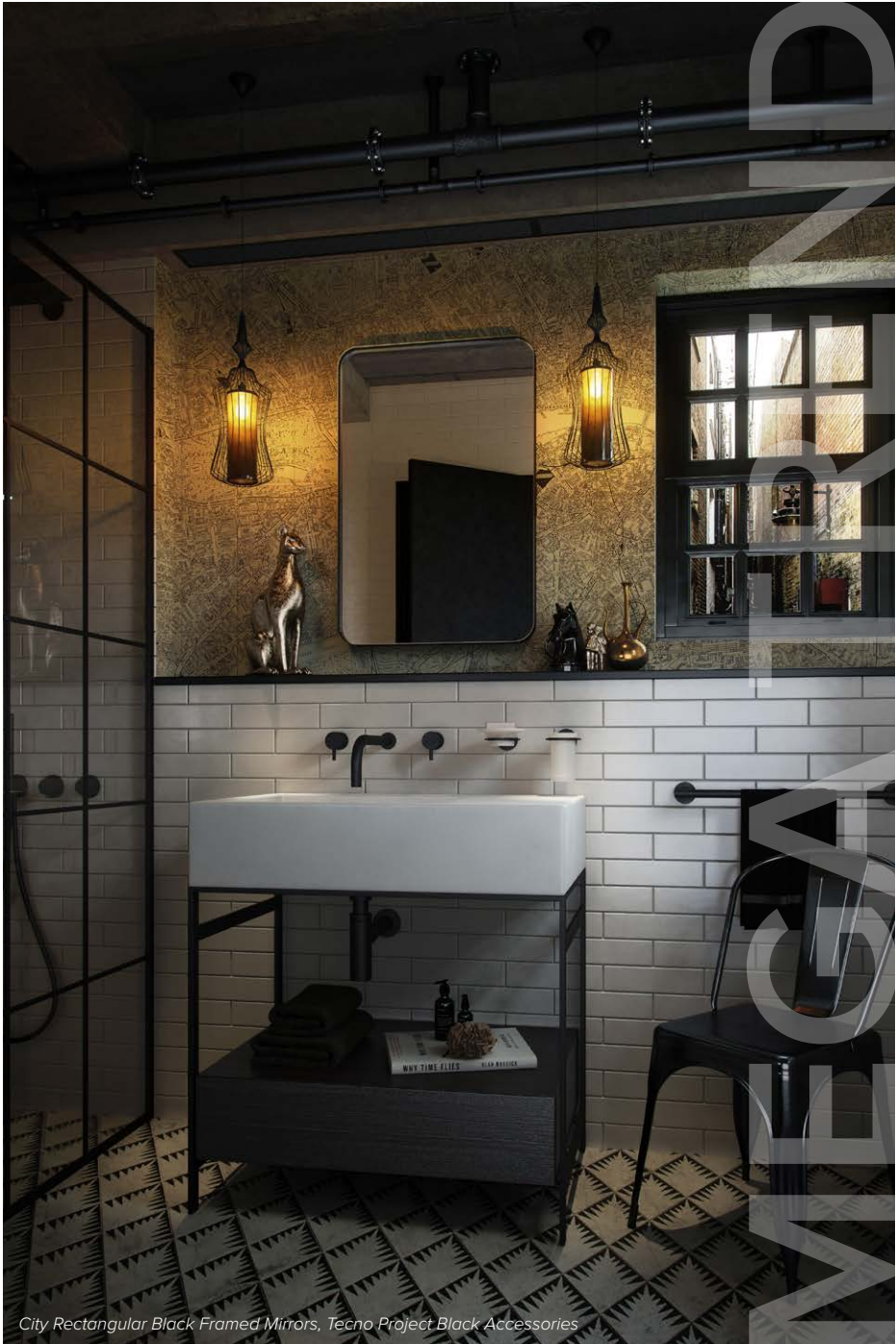
City Rectangular Black Framed Mirrors, Tecno Project Black Accessories