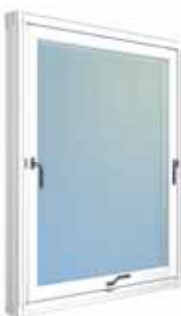
Closed position, interior view