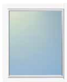
Closed position, exterior view aluminium clad