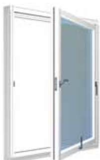
Cleaning position, interior view

NOTE: Size limitations also depend on the weight of the glazing, for further information please contact your nearest NorDan office.