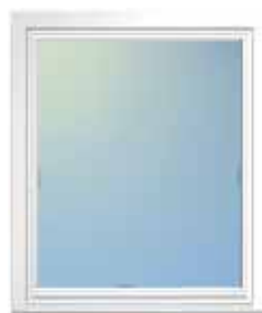
Closed position, exterior view standard timber