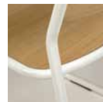
White powdercoated frame as standard.