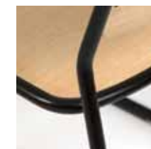
RAL colour frame available on request.