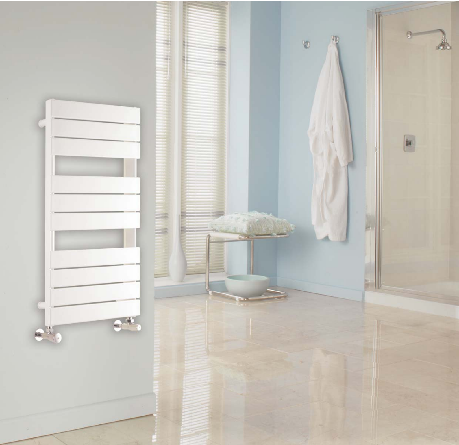
Pipe Centre Tappings (mm)