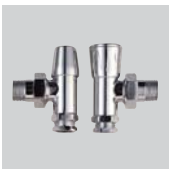
Valves. Please see page 94.

A compelling combination of simplicity and elegance. The appearance is sleek and smooth due to its streamlined layout of large flat tubes. A practical, attractive and compact choice which is available in any RAL or metallic colour finish.