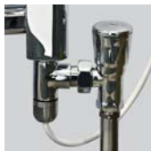
ECO450* - Dual fuel heater kit (available for INT2 & INT3 only).