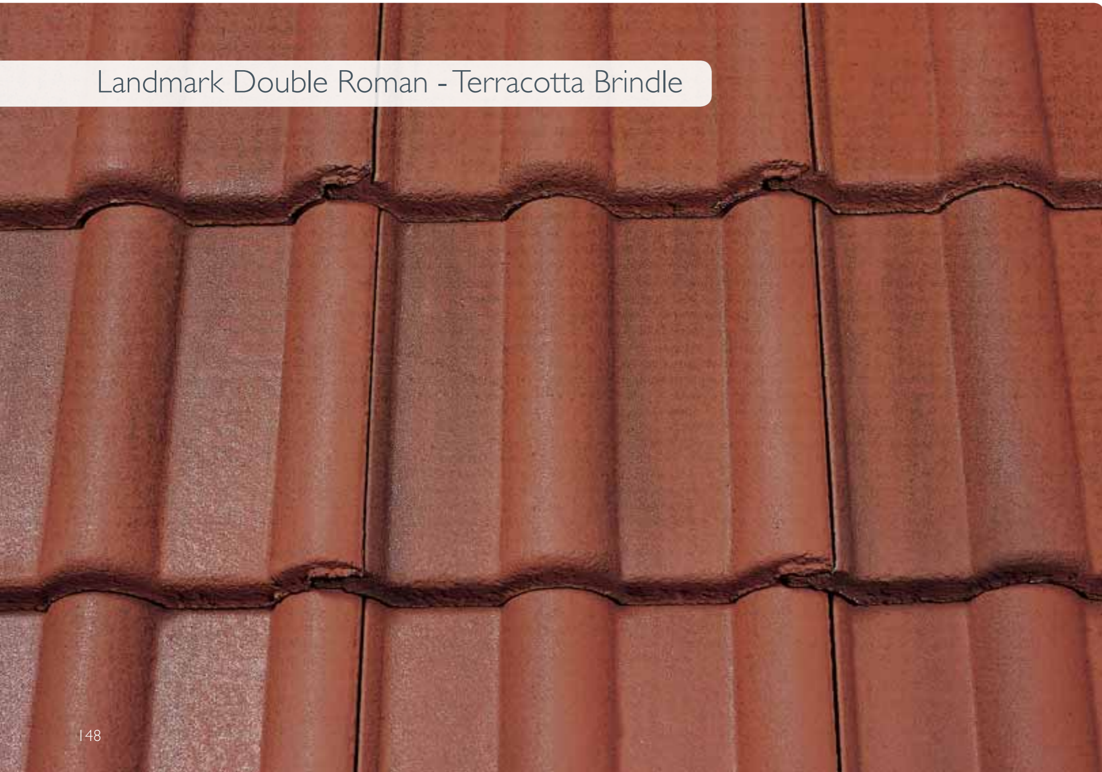
Landmark Double Roman - Terracotta Brindle