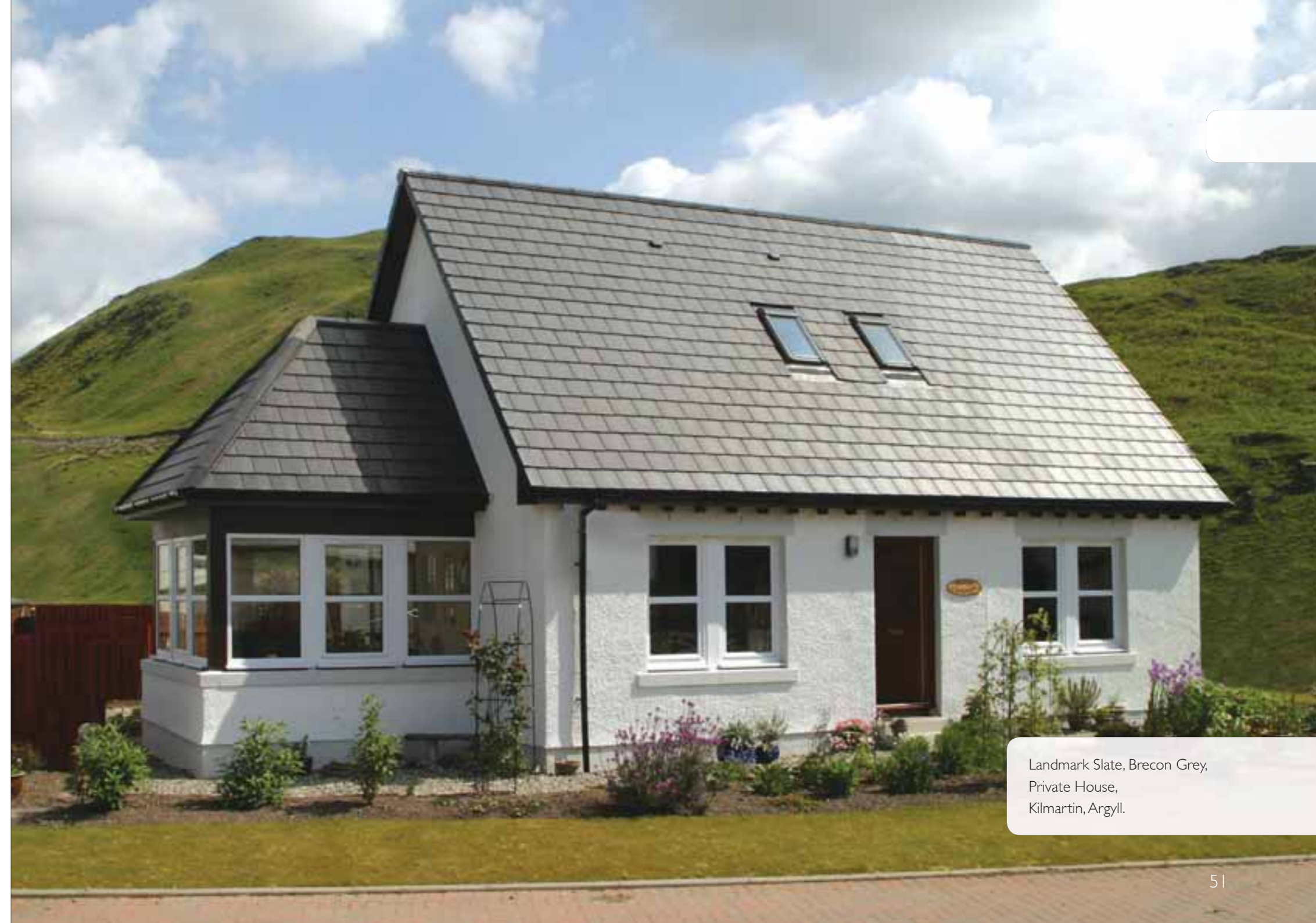
Landmark Slate, Brecon Grey, Private House, Kilmartin, Argyll.