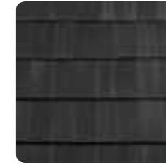
47 BRECON GREY

With their clean lines and natural, long lasting colour, Landmark 10 Slates capture all the appeal of Britain's dominant roofing material. Each tile incorporates subtle colour differences to replicate the variations typical of natural slate while offering a single nail fixing and low minimum pitch for maximum flexibility and performance.