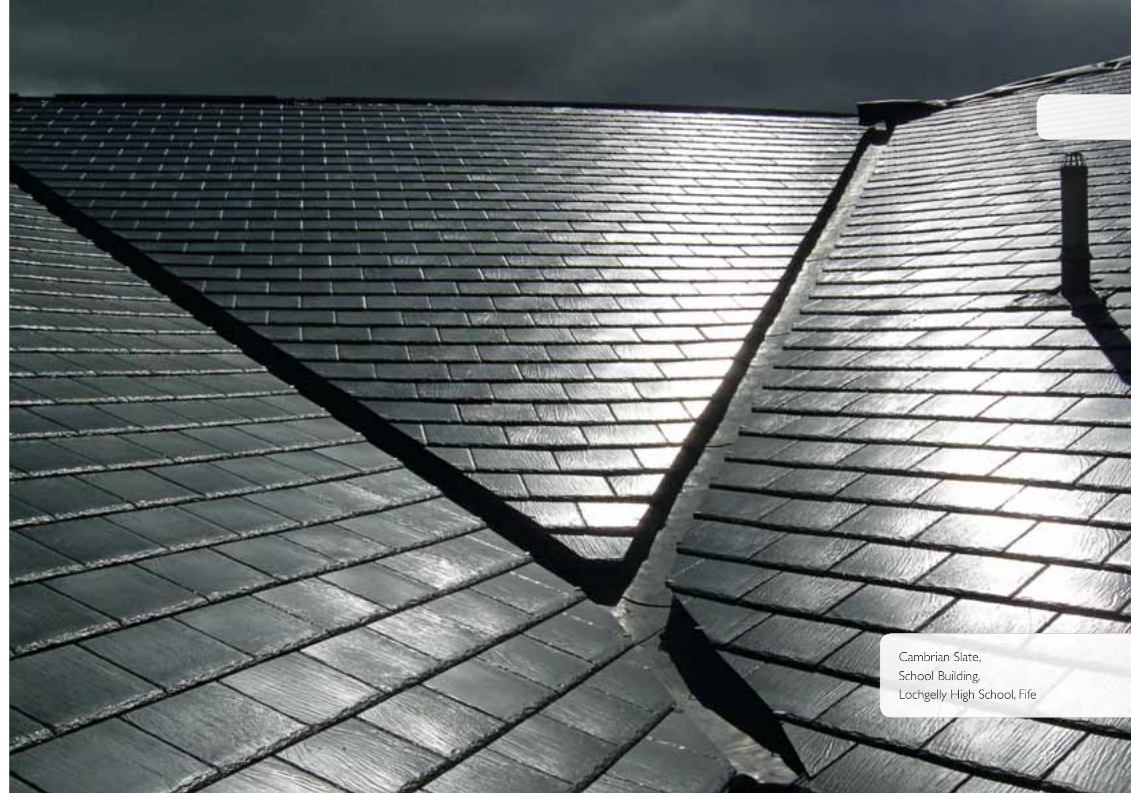
Cambrian Slate, School Building, Lochgelly High School, Fife