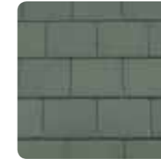
29 LANGDALE GREEN