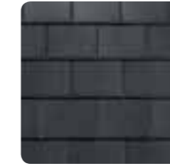
30 SLATE GREY