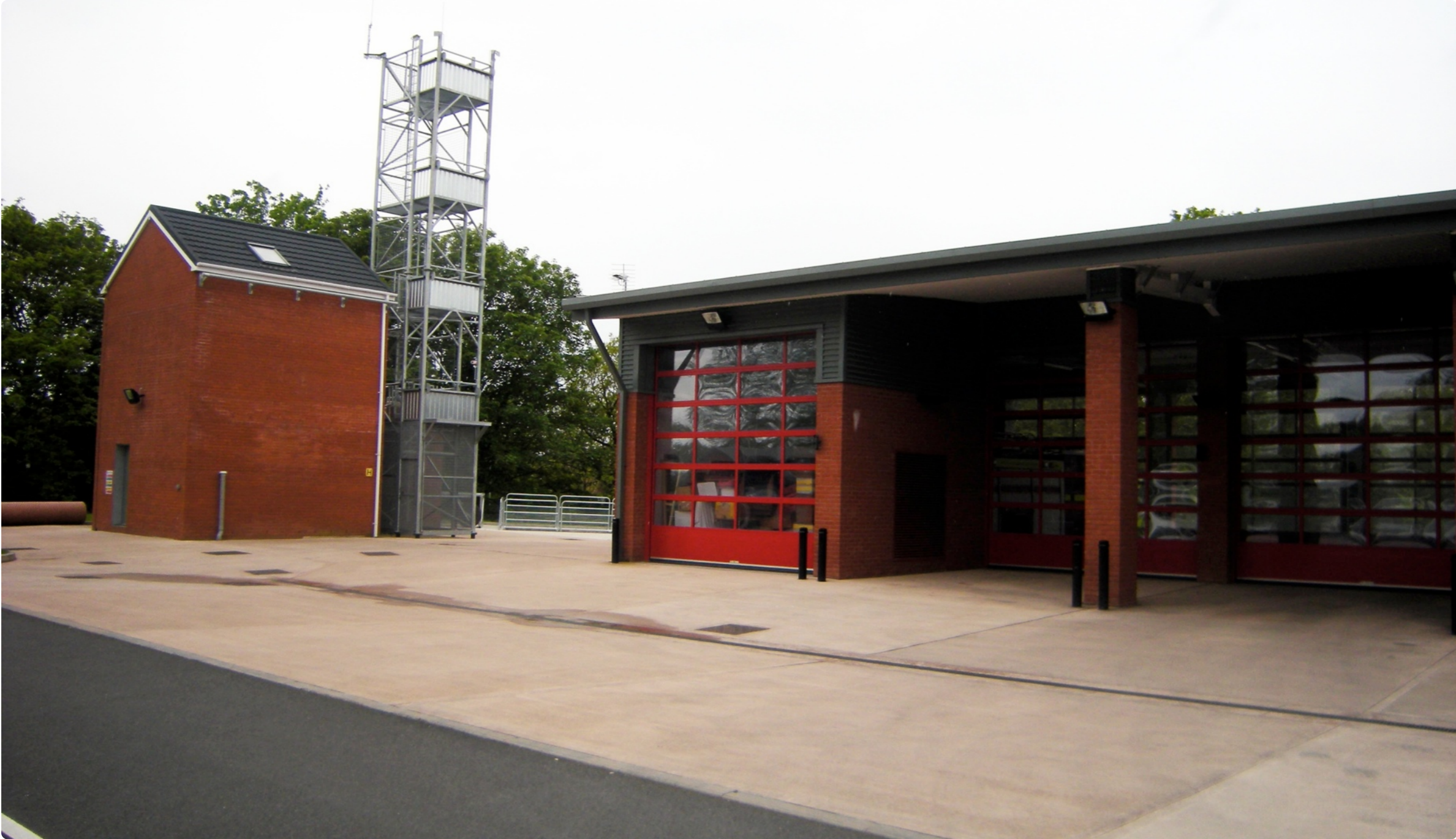
The training tower at Middlemoor Fire Station.