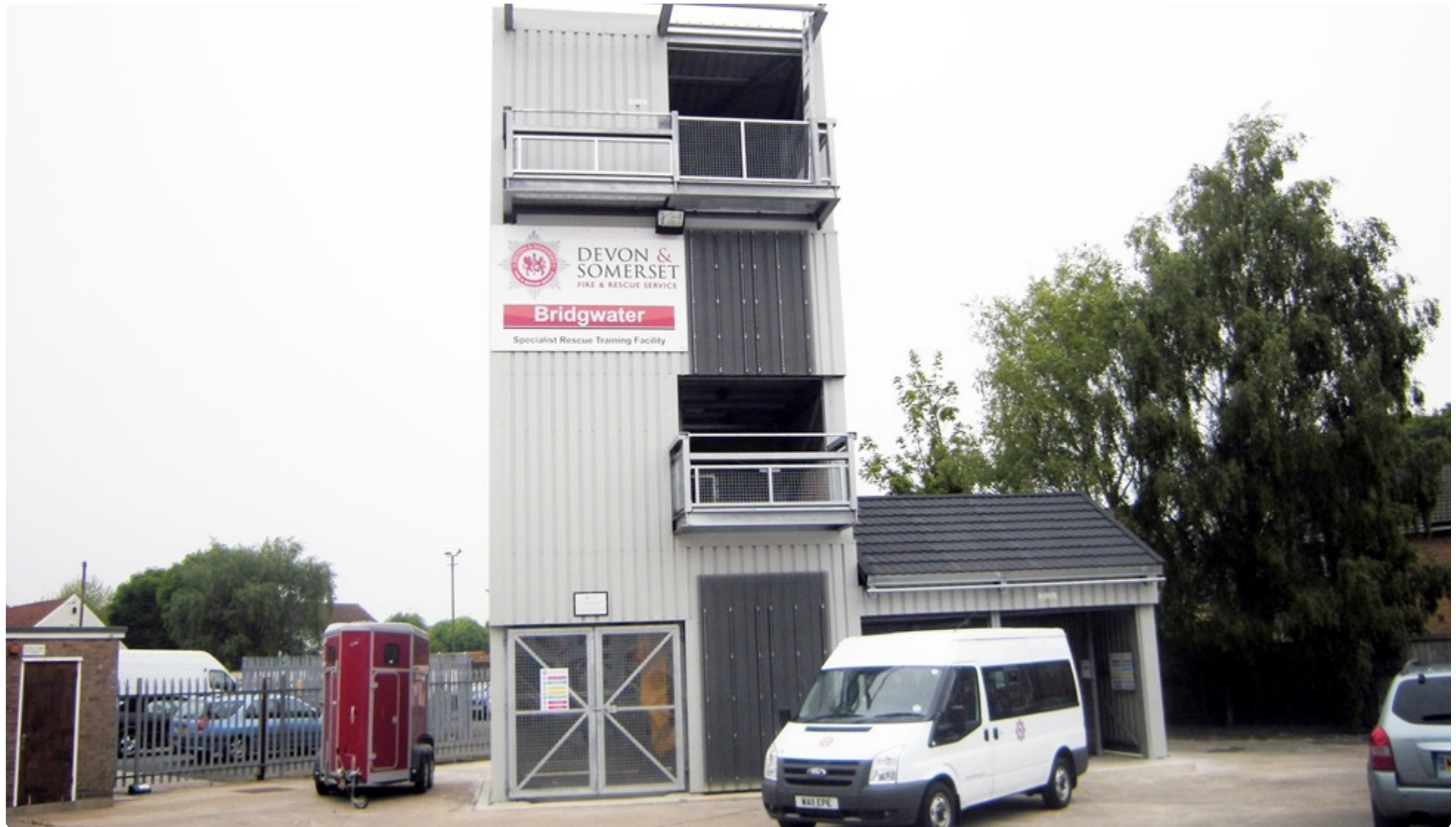
The training tower, located to the rear of Bridgwater Fire Station.