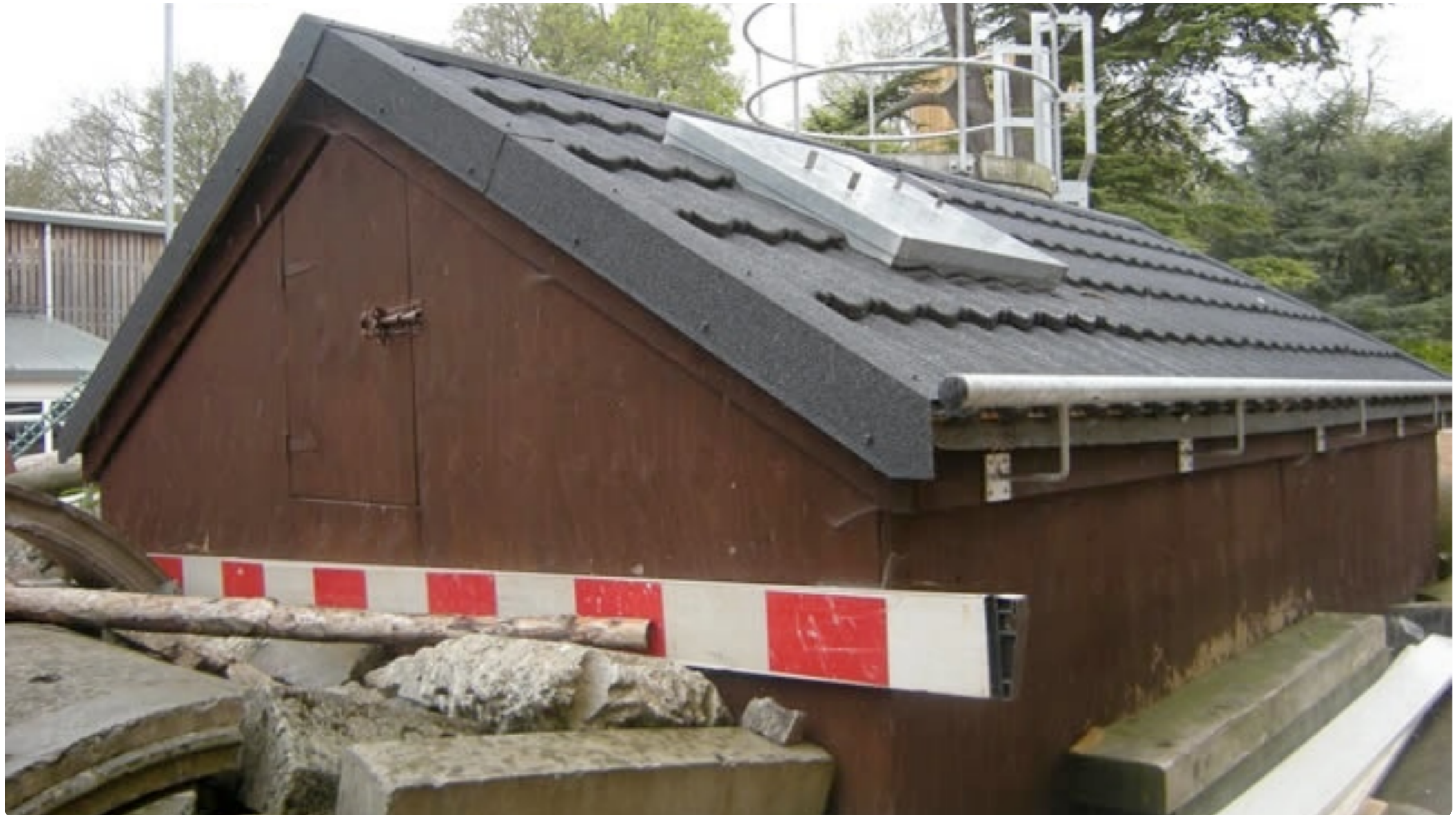
This building is used for live fire training and ladder drills.