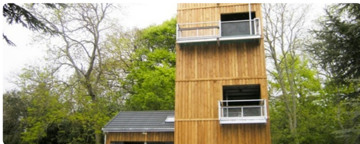
Metrotile Bond in Charcoal was chosen for this project.

Gallery: The training tower at Exeter HQ