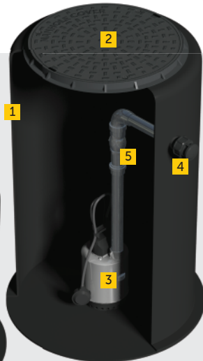
Marsh300S-10 Surface water pump station