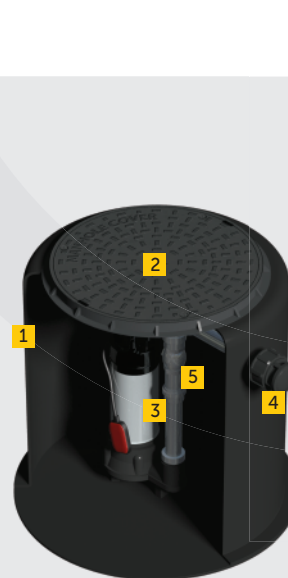
Marsh190F-6 Foul water pump station