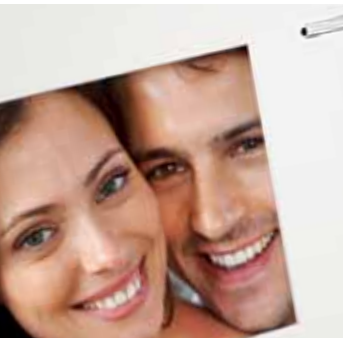
COMFORT AND SECURITY 3.5" colour display