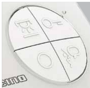
EASE OF USE Ergonomic push buttons