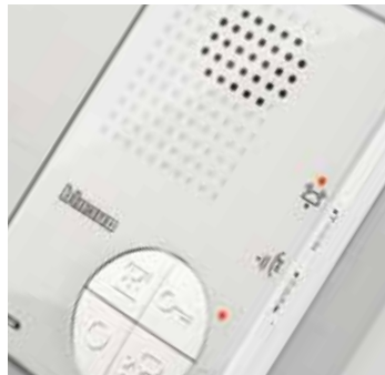
AUDIO OPTION Audio only version available