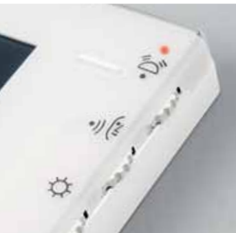
SLIM PROFILE Only 27 mm deep

, compact n design... ass above the th Classe 100