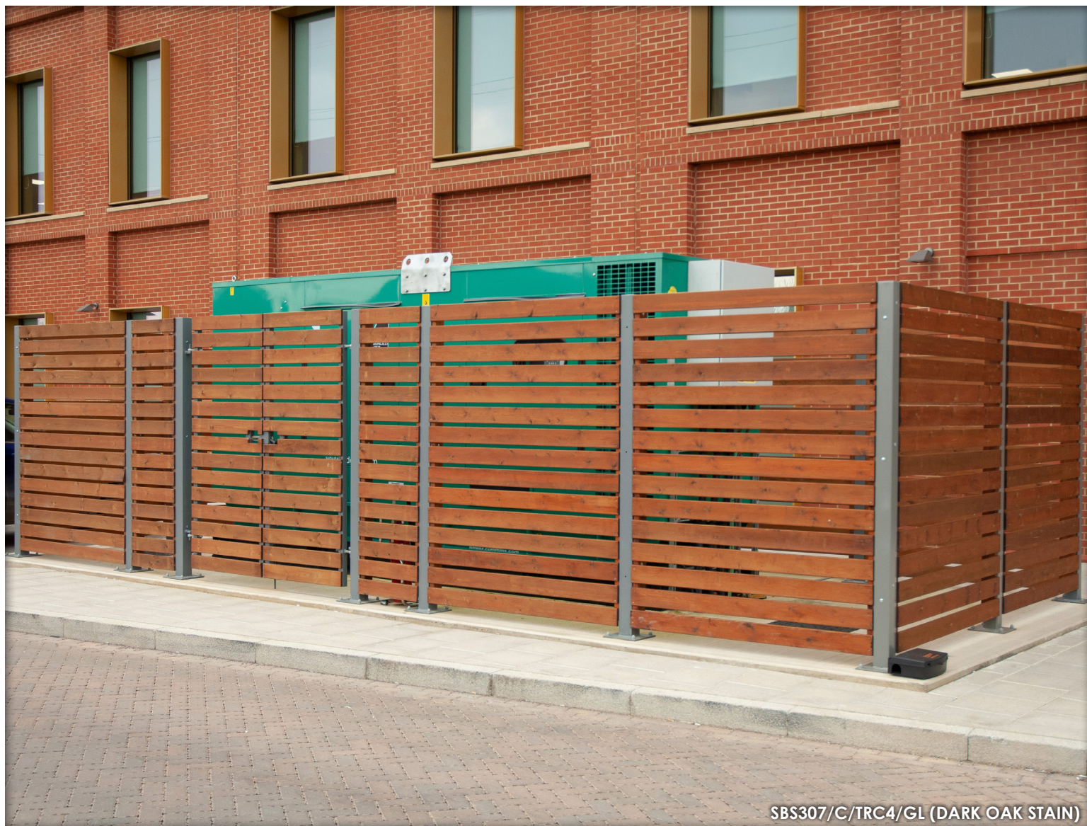
SBS307/C/TRC4/GL (DARK OAK STAIN)