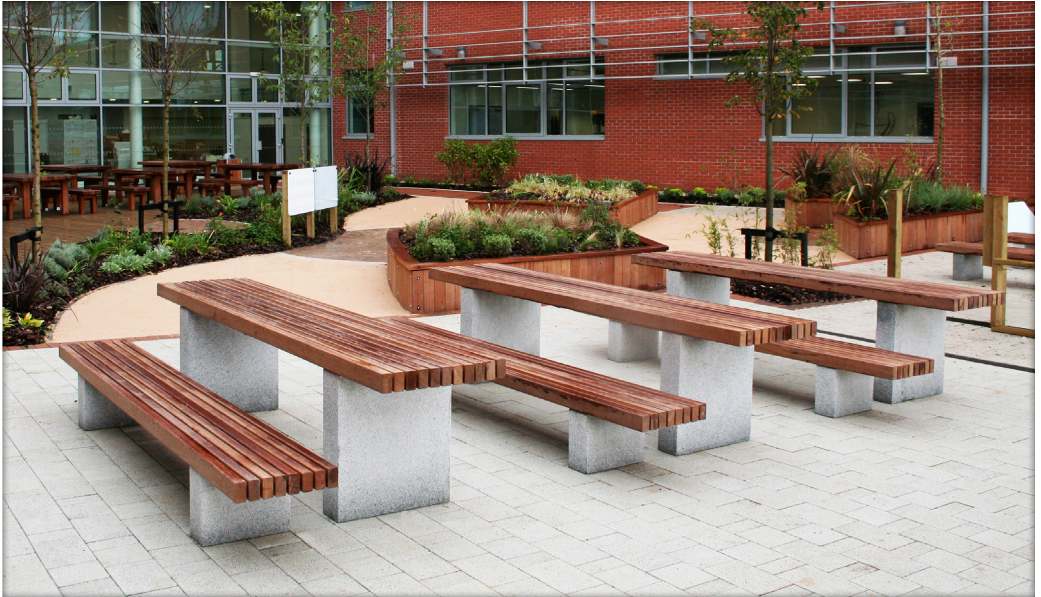
LPT105-3000/D-GG/HI/GL AND LBN114-3000/D-GG/HI/GL