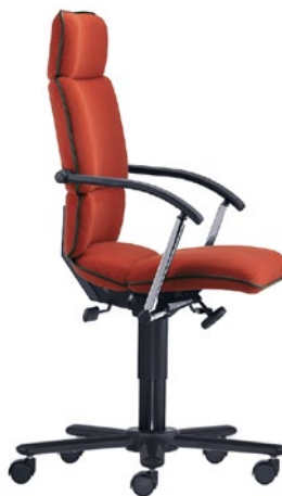
T-C8-A-D1-S active pelvic support height adjustable armrests shoulder support LS steel black