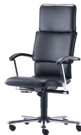
T-C10-A-D1-S active pelvic support height adjustable armrests shoulder support GV steel chrome