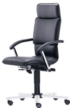
T-C8-A-D1-S active pelvic support height adjustable armrests shoulder support LW steel aluminium white

Collection C is top of the class in the world of office swivel chairs. The design communicates supremacy and stability. The finest materials and the highest craftsmanship make the chairs ideal candidates for management use. The claim implies first-class sitting comfort. The design of Collection C range illustrates the function of the active pelvic support. Design: Arno Votteler.