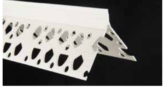
Feather Edge Angle Bead