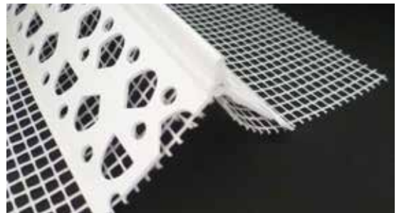
Angle Bead with Mesh