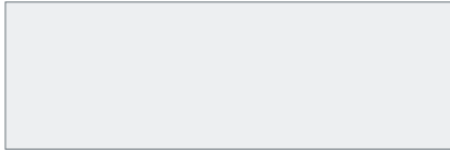
850 x 280mm