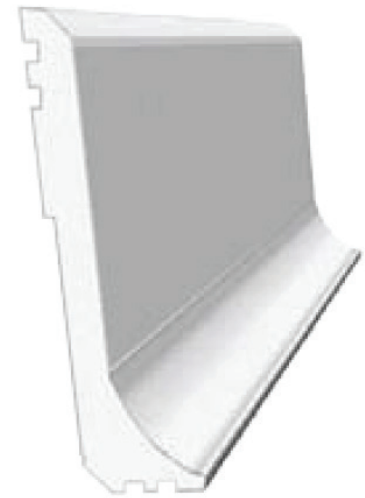
PolySto PV8F Skirting 3D section illustration

John Lord provide a full installation service and on-going staff training. Annual inspections and maintenance contracts are also available.