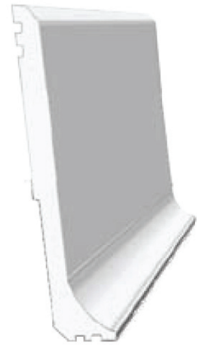
PolySto PV15F Skirting 3D section illustration

John Lord provide a full installation service and on-going staff training. Annual inspections and maintenance contracts are also available.