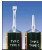
Tube Type C Repair

Durability: Shelf life of 3 years from date of production, if the products are always kept dry, free of frost and not stored above 30°C.