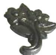
OPM2004 Small Flower Bunch