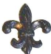
OPM2017 Fleur De Lys Small