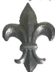
OPM2006 Fleur De Lys Large