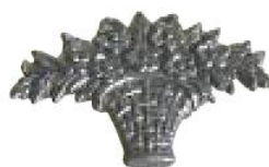
OPM2009 Large Flower Basket