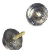
OPM2002 Lead Dot Small