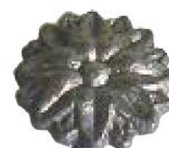
OPM2025 MT6 Lead Rose 2