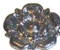
OPM2024 MT17 Tudor Rose 3.5