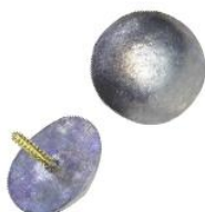
OPM2003 Lead Dot Large