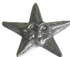
OPM2013 Sun 5 point