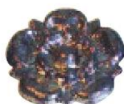
OPM2023 MT13 Tudor Rose 2.25