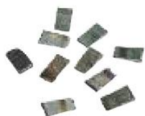
OPM2001 Lead Wedges (50 pk)