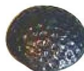
OPM2019 MT16 Lead Dot 1.25