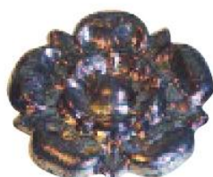
OPM2022 MT7 Tudor Rose 4.5