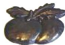
OPM2005 Cherry Bunch