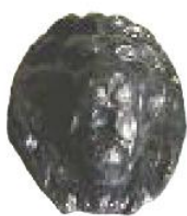
OPM2011 Lion Crest