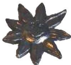
OPM2012 Sun 9 point